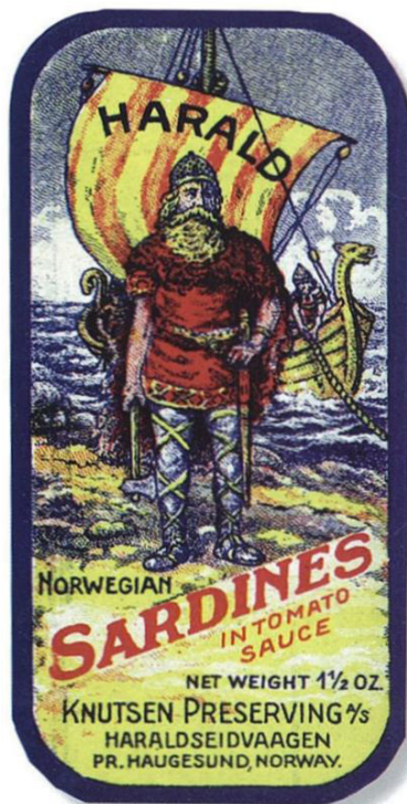
Figure 2. Harald Fairhair used as advertising for sardines from Haugesund (after Bjørnson 2004: 196).

cigars', stoneware with engravings of the Harald monument, and Harald amulets (Østensjø 1958: 297, 303–304). Commercial uses of the past were, in other words, the main motivation for the local community, and here national politics became instrumental tools for gaining attention and to attract a visitor and buyer market. The local patriotic goal was to put Haugesund on the world map. As such, the idea of the past as commodity was a vital driving force for a local memorial practice based on King Harald Fairhair. In the 1870s, Haugesund was a new 'Klondike-town' that had grown out of the boom caused by lucrative fishery exports, among others to England. Harald Fairhair could as a brand promote their position in the market. This is also evident during the twentieth century where the Viking hero Harald Fairhair was branded in several ways: as slogans for sardines, milk, soda pops, and other products (Figure 2). The positive character associated with Harald Fairhair—representing braveness, strength, healthy climate, etc. —defined a vast consumer culture.