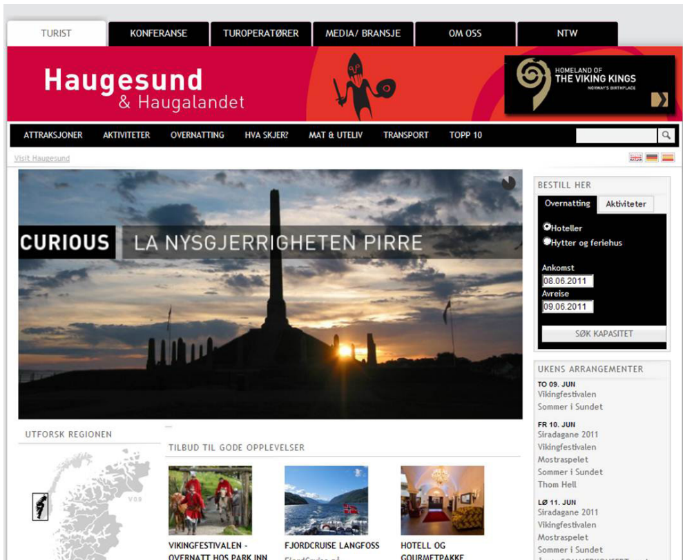
Figure 3. The ‘Harald silhouette’ on the website Visit Haugesund ( http://www.visithaugesund.no ).

Homeland of the Viking Kings”, and as expressed in similar terms at the website Visit Haugesund (Visit Haugesund 2013), the land ‘Haugalandet’ has become synonymous with a commercial region with numerous tourist attractions. The modern myth of Harald Fairhair constitutes a central part in this regional imagery (Figure 3). The regional image of ‘Haugalandet’, the Land of Mounds, is first and almost defined by a heritage where a homeland myth based on Harald Fairhair—the land of Kings—is synonymous with a Viking heritage. In a Norwegian context, other Viking regions compete in being similar commercialised regions. It is a regional romanticism that applies to late modern experience society within the scope of the heritage industry and which is based on popular uses of the Viking concept in general and Harald Fairhair in particular.