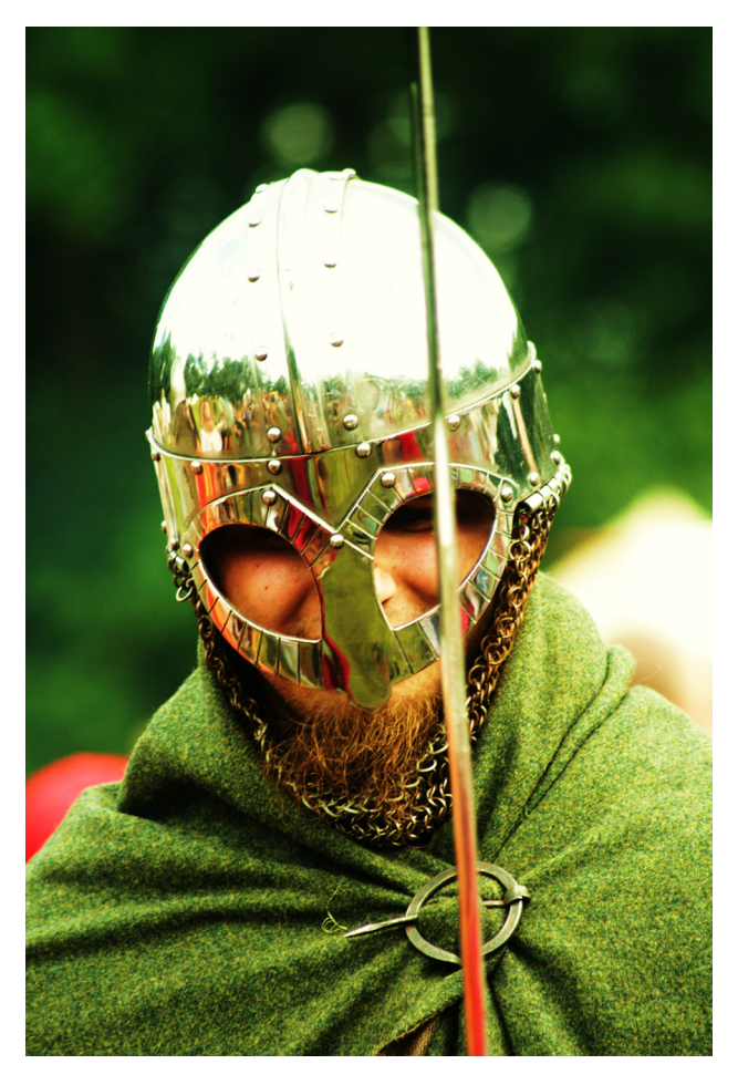
Figure 1. One of the contemporary Vikings, Grzybowo, Poland 2009.

In the same vein, the logic of time travelling is assumed by archaeologists and the cultural heritage industries. One can visit a Stone Age village, become a Viking for a moment (Figure 1), be a fearless Slav, and taste a delicious Early Middle Ages meal. In accordance with such trends, some re-enactment events promote themselves as being literally time machines (e.g., II Historical Picnic organised by the Historical Museum in Gdańsk, 29 October 2012, Poland). Nevertheless, the popularity of time travelling is worrying. Why?