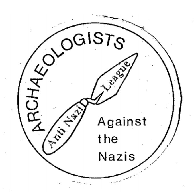
Image 2: Anti-Nazi League