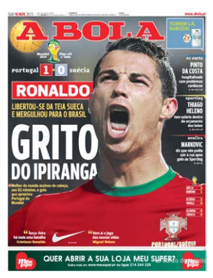
FIGURA 2 – Multimodal metaphor Grito do Ipiranga

However, we have argued that the blended scenarios arise out of the assemblage of the pictorial mode with the written mode, which conveys the counterfactual conceptualization frame. Moreover, we cannot solve the whole puzzle of the blending process without evoking the historical frame underlying the headline, "O Grito do Ipiranga" ("The Ipiranga cry"), which specifically signals a manifestation of joy, celebrating Brazil's independence from the Portuguese crown in colonial times. On architecturing a newly blended scenario, in which it is Ronaldo who voices the "Ipiranga cry" to celebrate the historical fact that Portugal has conquered the right to play in the Football World Cup in Brazil, the historical frame becomes clearly subverted but in a meaningful way, since Portugal has earned the right to come back to Brazil and play in the Football World Cup, which is in itself a historical fact.