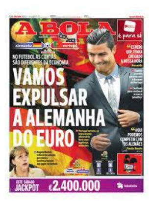
FIGURA 3 – Multimodal metaphor Vamos Expulsar a Alemanha do EURO

The fictive confrontation is staged, in the multimodal metaphoric blend, by metonymically selecting the photos of the two most prominent actors on each side of the imagined conflict, namely Cristiano Ronaldo for Portugal and Angela Merkel for the EU, in a very suggestive TOP/Ronaldo-DOWN/Merkel visually architectured layout.