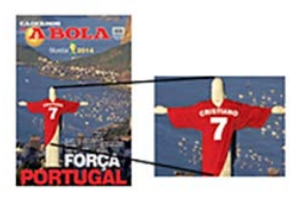
FIGURA 1 – Multimodal metaphor Força, Portugal (transl., Go, Portugal!)

In the above multimodal assemblage on the cover of the sports newspaper A Bola, issued shortly before the Football World Cup in Brazil in 2014, Christ the Redeemer, a worldwide known statue in Rio de Janeiro wears Cristiano Ronaldo's football team shirt, the captain of the Portuguese national team. Hence, the source and target of the multimodal metaphor are blended in the visual mode. Although the intended meaning of the multimodal metaphor "Go, Portugal!" is identified in the written mode, there is no doubt that the pictorial mode overpowers the written mode in the image-text interface. Notice that this blended multimodal assemblage is far from expected, since it architectures a new blended scenario, in which "God is Portuguese", a counterfactual statement challenging the culture-bound frame Brazilians cling to in all life-challenging situations but, above all, in football match related scenarios, namely, "God is Brazilian".