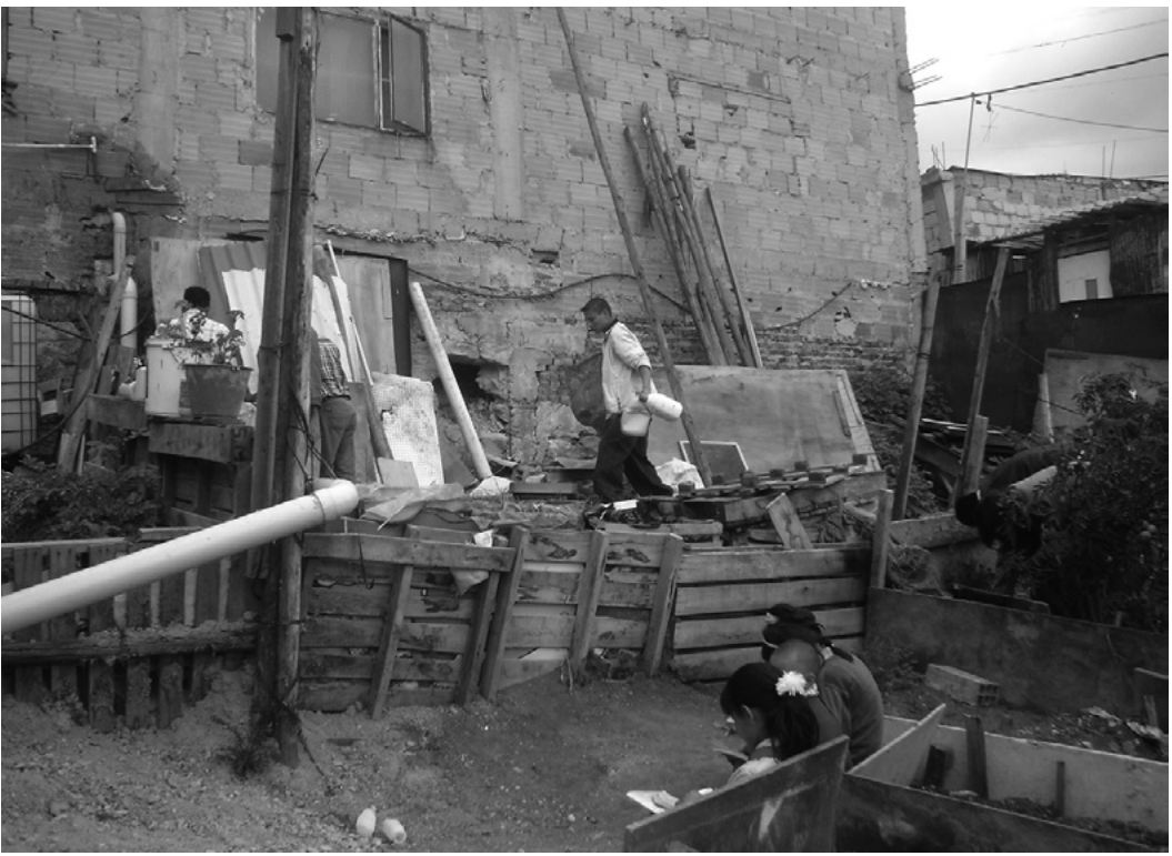
Figure 4. Acondicionameiento del lote para la huerta.