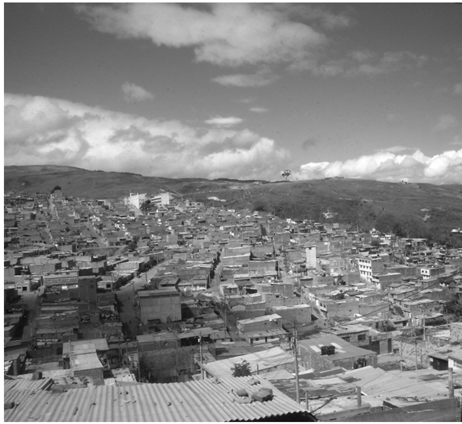
Figure 3. La huerta Cultus. Foto: Ludmila Ferrari, 2008.