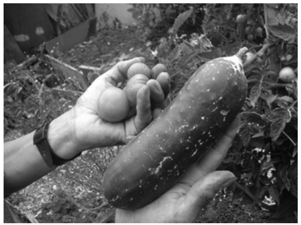
Figure 6. Semilleros y primeros cultivos de la huerta.