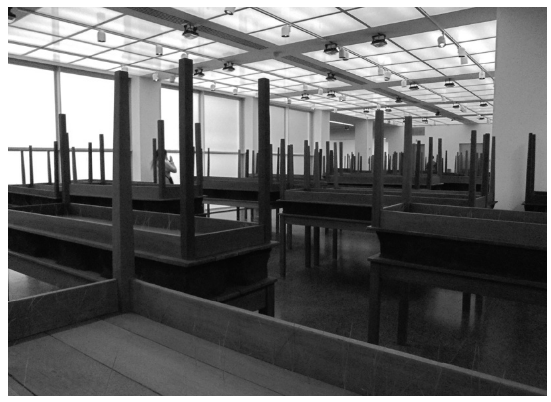
Figure 2. Plegaria Muda in the Museum of Contemporary Art Chicago (2015).

sed by the fact that the victims and perpetrators often lived in the same neighborhood and in similarly precarious circumstances. According to the Los Angeles Police Department, more than 450 gangs, including 45.000 individuals, operate in the city and some of these groups have been active for over 50 years (Los Angeles Police Department). These organizations are sometimes involved in drug trafficking and usually form along migratory or racial backgrounds (Zilberg, 2004, 761). Gangs identify with and defend a certain area in Los Angeles and consequently fight rival cliques in their zones. This territorial logic puts civilians' living in a ganginflicted neighborhood at risk, since they may be targeted due to their location, even though they are not affiliated with any group (Los Angeles Police Department).