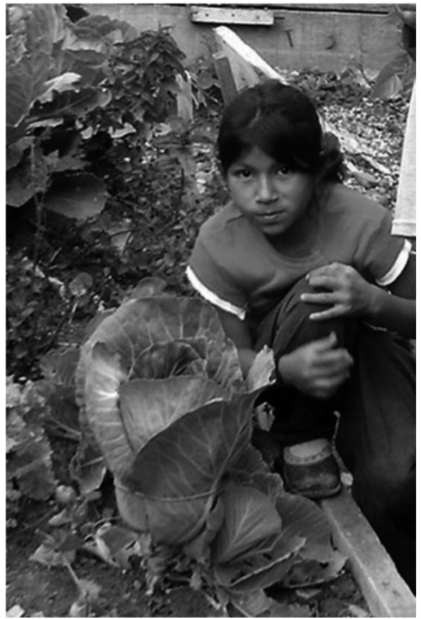
Figure 5. La huerta Cultus en un día de trabajo. Foto: Ludmila Ferrari, 2008.