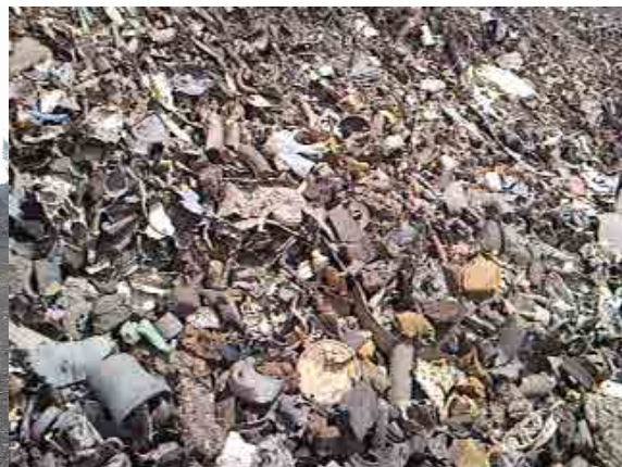
FIG. 2. Material composing the waste.

The company develops innovative projects aimed at improving competitiveness through energy efficiency and production increase. For this reason, the company signed an agreement with the Universidad Pedagógica y Tecnológica de Colombia (UPTC) through the Instituto de Investigación e Innovación en Ciencia y Tecnología de los Materiales (INCITEMA) , and hired the services of SPIN OFF ENERMA at the Siegen University (Germany) to model processes and analyze products. The project was conducted between 2012 and 2015, and was funded by COLCIENCIAS (invitation 548 of 2012), which gives tax benefits for investing in Sciences, Technology and Innovation.