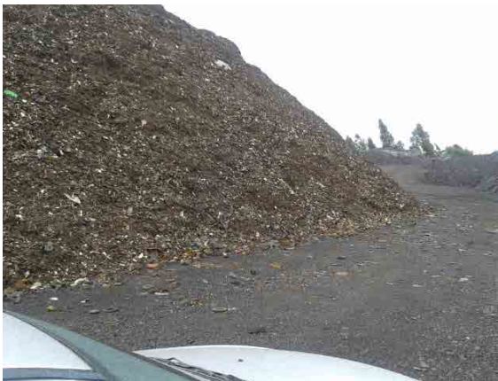
FIG. 1. Pile of shredded scrap waste.

SIDERÚRGICA NACIONAL SIDENAL S.A. is located in the industrial park of Sogamoso (Department of Boyacá). This siderurgic annually process 250 000 tons of steel, manufacturing products for construction, such as bars, profiles, rebars, and meshes. SIDENAL is a semi-integrated siderurgic that uses scrap as raw material, which is fused in an electric arc furnace.