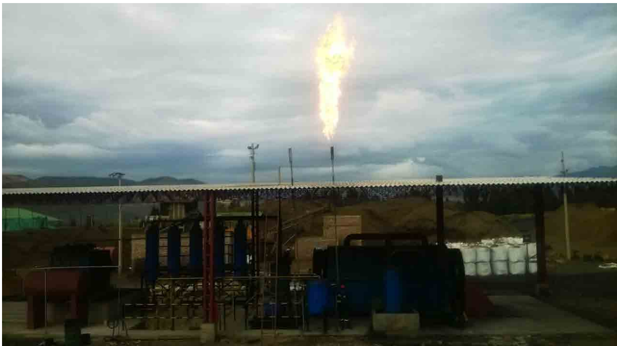
FIG. 4. Pyrolysis plant working and showing the synthesis gas emission.