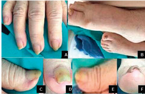
Figure 2. A-F. Yellowish discoloration in fingernails and toenails, most of them showing features of pincer nails; B. Bilateral lower limb edema; C-E. Typical pincer nails in the first toes; F. Left first toe affected by yellow-brownish chromonychia, in addition to pincer nail

Computed tomography images with contrast of the abdomen and pelvis disclosed a Phrygian cap gallbladder (See Figures 3A to 3D), small hiatus hernia (See Figures 3E and 3F), diverticulosis and sigmoid diverticulitis (See Figure 3G), and an adjacent abscess measuring 8.4 x 3.6 x 3.0 cm and 47.8 cm 3 (See Figure 3H). The patient had a dietary and clinical management, and underwent an antimicrobial schedule with metronidazole (1500 mg/day) and