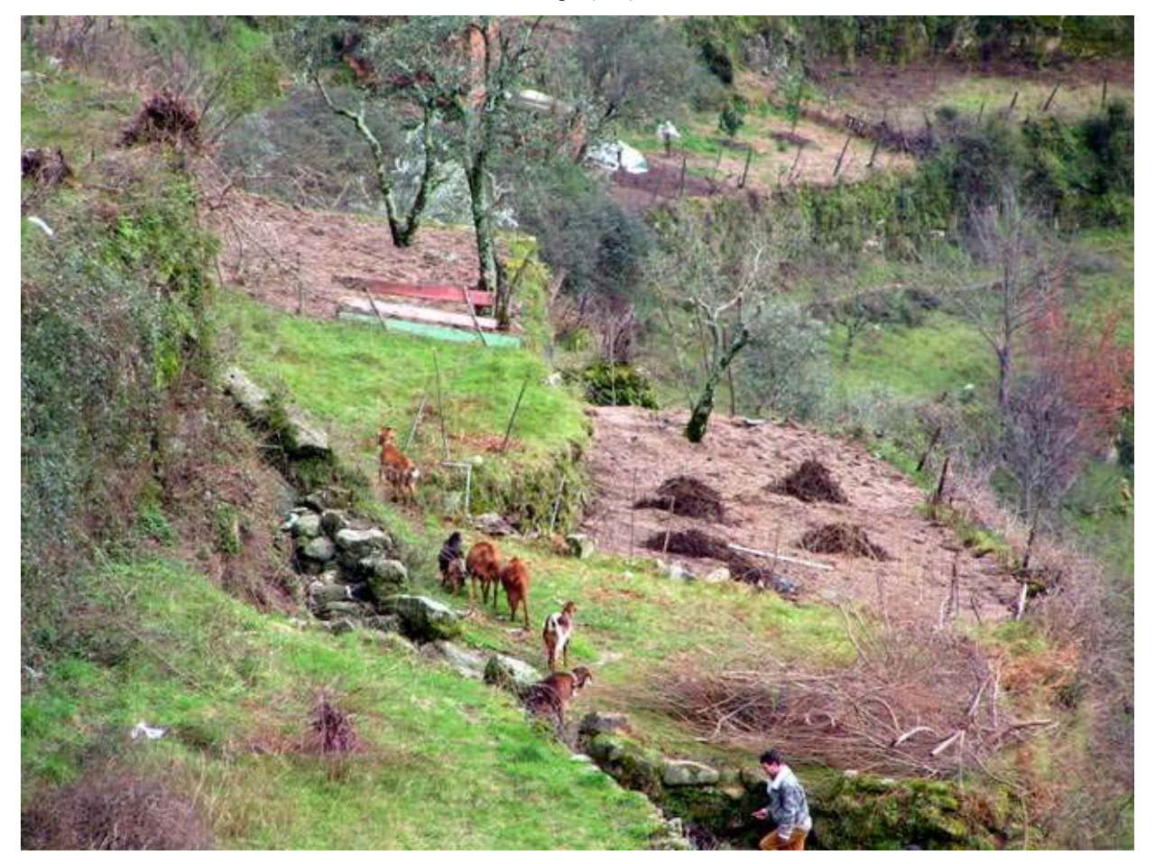
Fig. 5 Monumental and epic landscape of Loriga: Terraces built by the human's arm and composted by "the ass of the sheep".(AQ)

The tragic (and dramatic ), when we observe the process of abandonment of the cultural landscapes, total or partial when he left