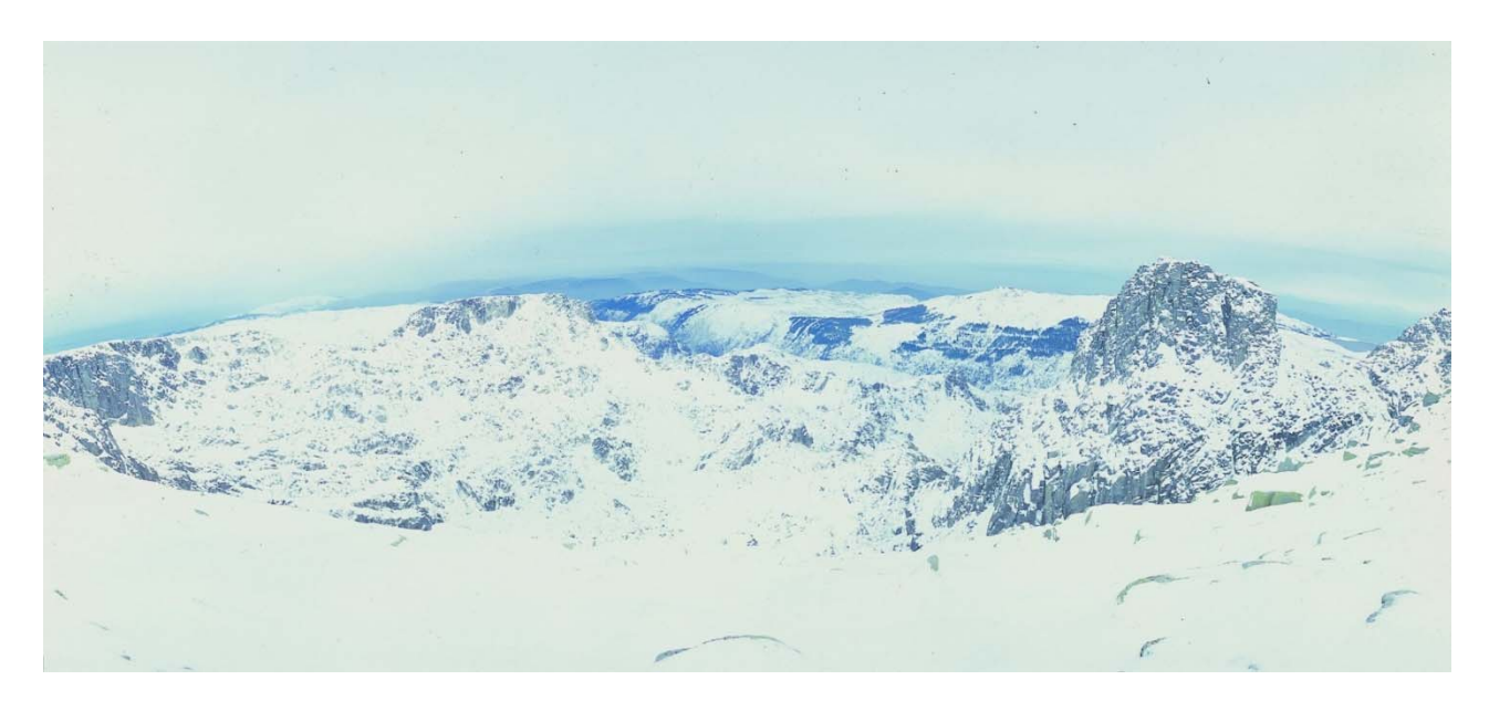
Fig. 1 The geodiversity and the revelation of the sublime and mysterious: it was the passage of the glacier below the granitic mass of Cântaro Magro (Potted Thin), that lifted them over the landscape and opened the glacial Valley of Loriga. Portugal, Serra da Estrela (Star Mountain). (PM)

Our definition of the wonderful on landscape, it is the beautiful ascend to a