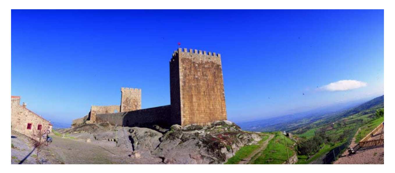
Fig.3 The geodiversity and the History reveal the sublime and mysterious. Fraga da Pena: "Castro" (village fortified) from the Bronze age. Castle Koppie, Inselberg with orthogonal diaclases. Tor, granitic Tower, with the blocks in situ. Situated in the Serra da Estrela (Star Mountain), in Queiriz, Fornos de Algodres.(PM)

The monumental concept on the landscape, he signifies the recognition of the transformation of the landscape for his