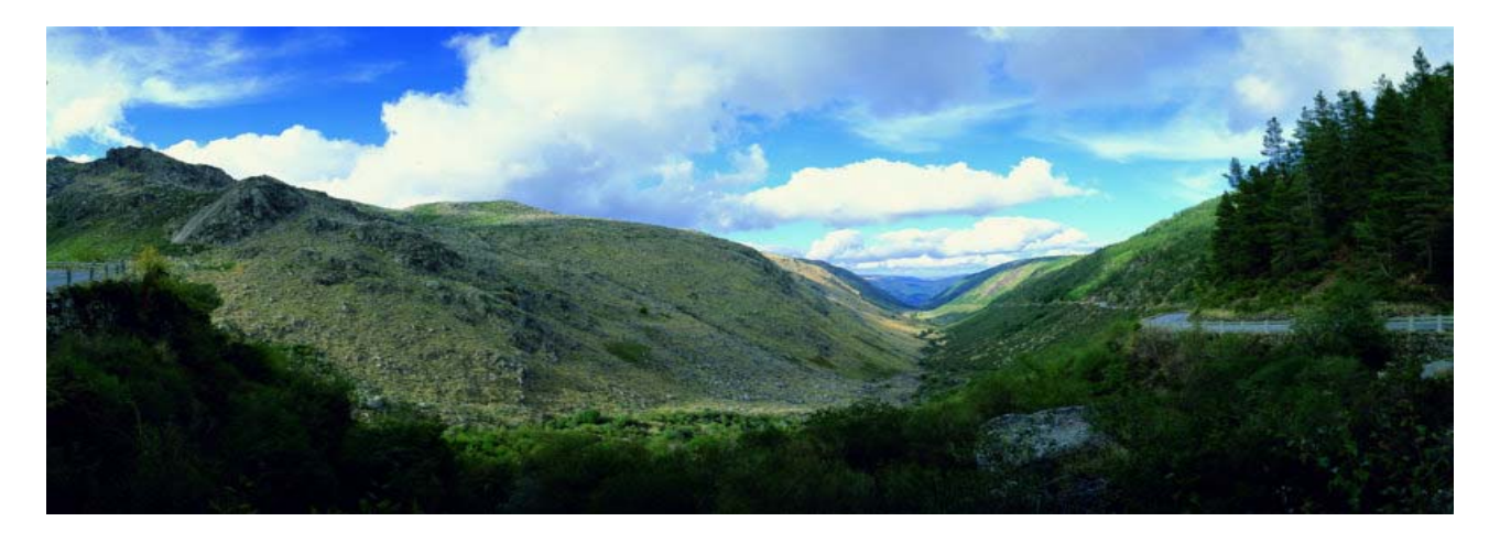
Fig. 2 The wonderful, geodiversity and the revelation of the mysterious: monumental Valley of Manteigas (Butter's Valley) shaped like a U, for being of glacial origin. Portugal, Serra da Estrela (Star Mountain). (PM)

superior exponent, with some, or all of the senses stimulated by a higher emotion.