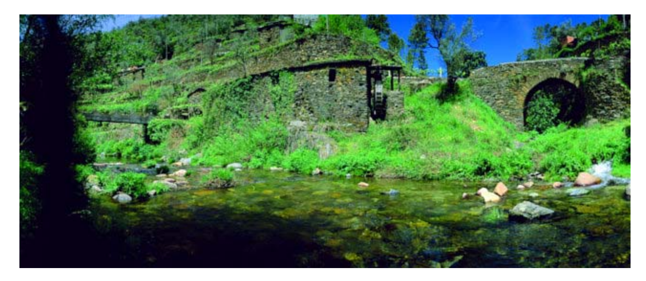
Fig. 6 The beautiful and the tragic explained by the History and the Ethnography: Casal do Rei (Couple of King). The mill and the shale bridge (PM)

behind the ruins of a farmer, an old mill, a broken wheel, that are the lost signs of the presence of human communities.