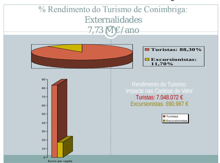
Table 5. Externalities of Museum of Conimbriga visitors

What represents this global value to the national economy? We must confine our study on the context of a sample article, but we can give an example about what means "enhancing their touristic valour", reveling the last values of the Museu of Conimbriga long study of tourism impact on the Chains of Valor of tourism. This museum represents the micro cosmos of Portuguese tourism: visitors came for all Portuguese regions and from all the countries, on a correct balance of social levels, gender and age, face the national tourism data.