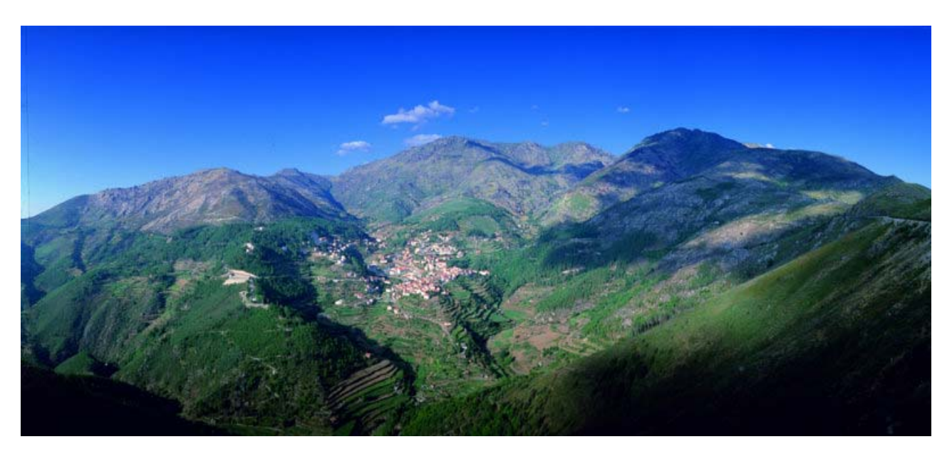
Fig. 4 Monumental and epic landscape of Loriga: Terraces and glacial Valley of Loriga (PM)

humanization through work-wide human, creating the beautiful in a large dimension, a monumental dimension.