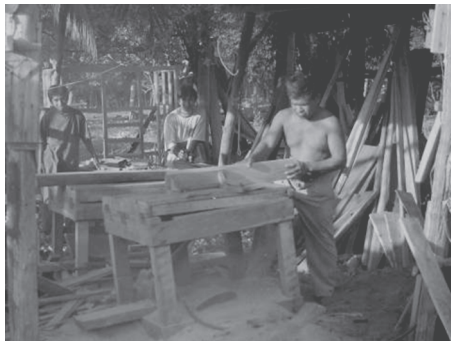
FIGURE 7. REPLICATION OF WOOD SHUTTERS, doors, and furniture.