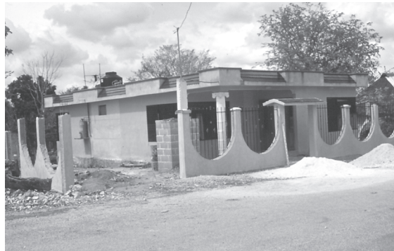
FIGURE 12. TYPE 4 STRUCTURE.