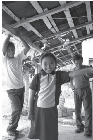
FIGURE 9. USE AND DISTRIBUTION OF THE TECHNOLOGY to persons of all ages.