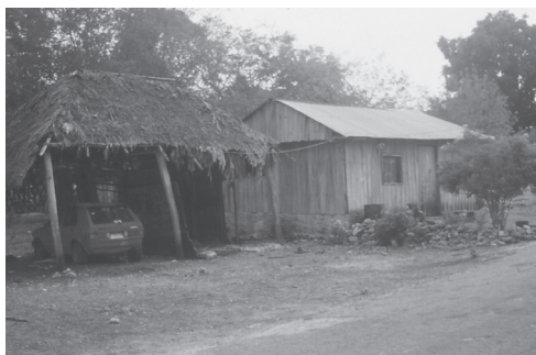
FIGURE 2. TYPE 3 STRUCTURE (left) and type 1 structure reused as a garage.