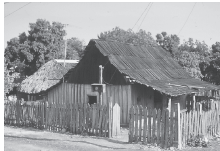
FIGURE 5. REDESIGN –a tandem plan construction with a Type 3 structure in front and a Type 1 structure at the back.