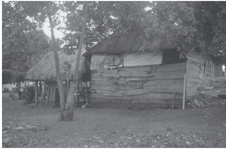
FIGURE 4. EXPERIMENTATION with new materials.