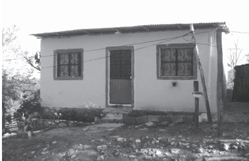
FIGURE 8. REPLICATION AND ACQUISITION OF FUNCTIONAL VARIANTS, such as this Type 2 cement block house.