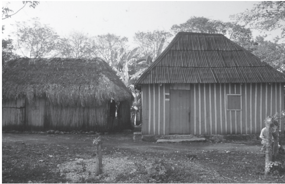
FIGURE 11. TYPE 1 HOUSE (right); Type 3 house (left).