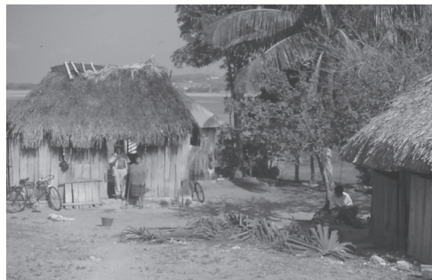
FIGURE 10. TYPE 1 STRUCTURE.