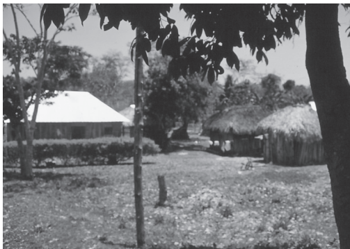
FIGURE 13. SPATIAL SYNTAX OF THE FAMILY CYCLE, with two Type 1 houses and one Type 3 house on the same house lot.