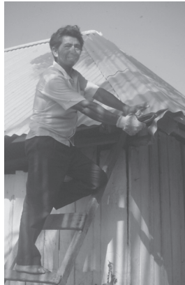
FIGURE 6. REPLICATION OF LAMINATE ROOFING, labor sharing with neighbors.