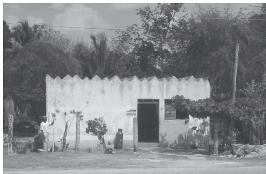
FIGURE 3. ONE OF THE EARLIEST TYPE 2 STRUCTURES built in Silvituc.