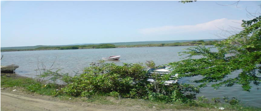
Figure No. 1. The fishing camp "The Tazajal"