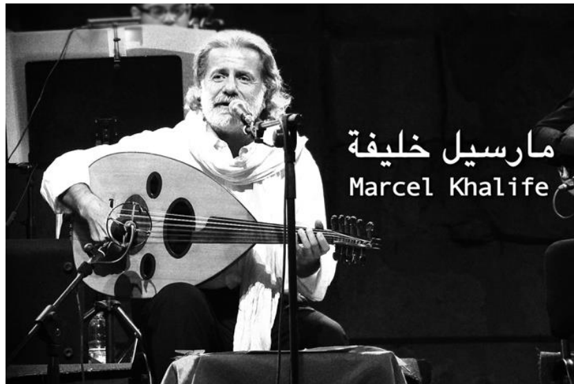
Image 1. Photo of Marcel Khalife playing the 'oud and singing during a concert

life and freedom". For Edward Said Khalife is an "Iconic figure if contemporary Arab culture" (Qantara, 2005).