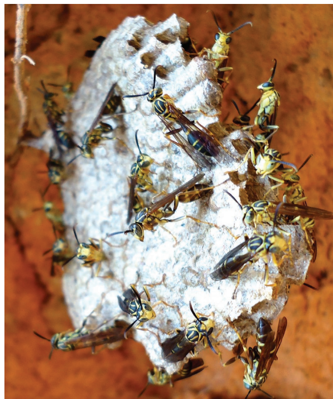
Figure 2. Nests of the wasp Mischocyttarus consimilis Zikán in the municipality of São Gonçalo do Sapucaí, Minas Gerais.