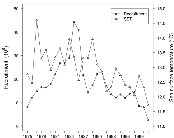
Figure 1. Recruitment time series off jack mackerel and sea surface temperature between 1975-2001 / Series temporales del reclutamiento de jurel y la temperatura superficial del mar entre 1975-2001

Exploration of the R and SST time series reveals an important degree of correlation, which is mainly explained by the trend changes occurring between 1984 and 2000. This period was characterized by a reduction of close to 50% in the recruitment and observed SST (Fig. 1). On the other hand, after assessing the annual productivity of the jack mackerel population, y_t (eq. 3), it becomes obvious that a linear assumption between y_t and