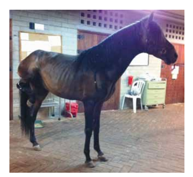
Figure 1. Hyperflexion of the right hind limb while standing.

and during reflex contraction. Insertional activity was measured 3 times and then each muscle was observed for spontaneous activity at rest (Wijnberg, 2003). EMG showed an exaggerated electrical activity of the lateral digital extensor muscle and a disorganized spontaneous electrical activity in both hind limbs. Decreased voluntary activity compatible with denervation of the hindquarters' lateral digital extensor muscles was observed.