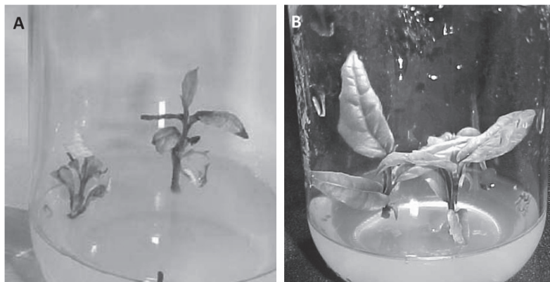
Figure 1. Establishment of microshoots of Beilschimidia berteriana after 45 days of incubation on culture media. A) Microshoots in medium MS 1/4 . B) Microshoots in medium DKW 1/2 .