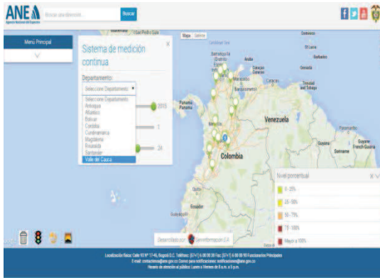
FIG. 5. Monitoring system in Colombia NSA [11].

The need to create a regulatory development that includes the following criteria is evident: