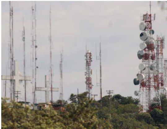
FIG. 3. Visual pollution caused by telecommunications infrastructure.

In addition to the possible effects on health by NIR causing community fears, the damage to the environment is also found and it is caused by the visual pollution as illustrated in Fig. 3. Given this situation, municipalities create barriers in their development plans, to the proper deployment of infrastructure to ensure quality standards required by users.