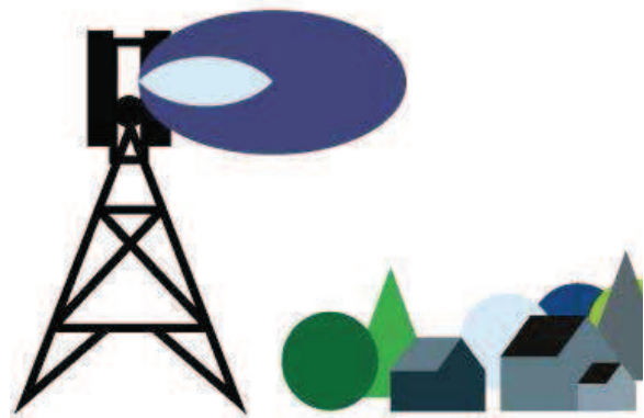
FIG. 1. Mobile telephony field emission [15].

Studies such as those conducted by the Global System Mobile Association (GSMA), system owners claiming that the radiation emitted by mobile stations do not generate any kind of impact on human health and the radiation level indicator is only 0.1%, well below the legally established levels by the ICNIRP [17], GSMA also states that the radiation pattern emitted by mobile stations is horizontal, as illustrated in Fig. 1. In this way the inhabitants of the surrounding populations are not harmed, according this association [15].