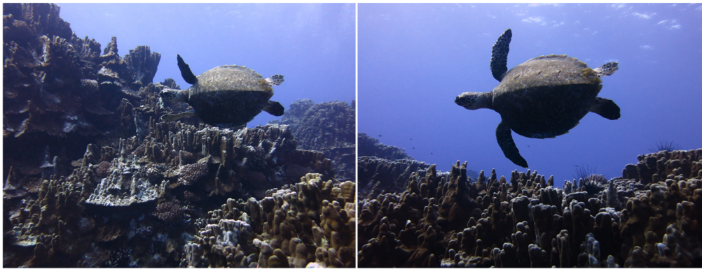
Figure 2. Individual of Eretmochelys imbricata swimming in coral reef 200 m west of Hanga Roa bay, Easter Island / Individuo de Eretmochelys imbricata nadando en el arrecife de coral a 200 m al oeste de la bahía Hanga Roa, Isla de Pascua