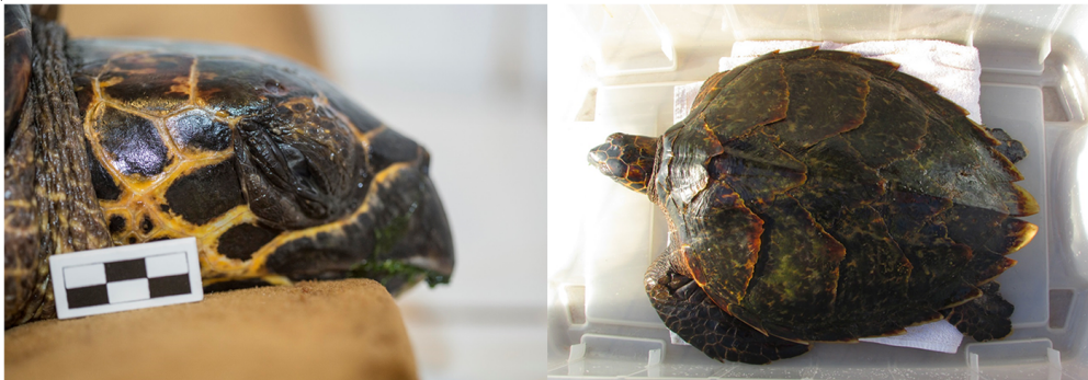
Figure 3. Juvenile Eretmochelys imbricata found floating on water surface. In the left photo a standard scale of 3 cm divided in 1 cm rectangles was used. Right photo shows the absence of its anterior right flipper and a marked indentation in the rear portion of the first central scute / Juvenil de Eretmochelys imbricata encontrado flotando en la superficie del agua. En la foto de la izquierda se utilizó una regla estándar de 3 cm dividida en 1 cm. La foto de la derecha muestra la ausencia de su aleta anterior derecha y una marcada hendidura en la porción posterior del primer escudo central

The 2014 individual was differentiated from the 2013 individual due to the absence of its anterior right flipper with well-healed tissue on the stump and the shape of the first central scute, which presented a marked indentation at its rear portion, probably caused by a lacerating wound (Figs. 2 and 3). Measurements of this individual were obtained based on Bolten (1999). The straight measurements of the 2014 turtle were obtained with a digital caliper (Mitutoyo model 700-128) with a 0.5 mm error and the curved measurements were determined with metric measuring tape. The weight was obtained with a balance (model PHSO40) with an error of \pm 40 g.