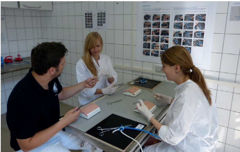
Figure 1. Students learning to suture and tie knots using simple models in the clinical skills laboratory at the University of Veterinary Medicine Hannover, Germany.

A growing array of models and simulators have been developed by veterinary educators (Scalese and Issenberg, 2005; Baillie, 2007; Fox et al. , 2013; Gerke, et al. , 2015). These are often housed in a purpose built room or centre, the clinical skills laboratory (Figure 1), which provides a venue for teaching practical sessions and a place where students can practise repeatedly and develop proficiency in a safe environment. Ideally students should be able to customise their learning and address any deficiencies in a timely manner, for example it is helpful to be able to practise suturing and knot tying on models prior to a surgery rotation. Clinical skills laboratories are often used to run assessments (May and Head, 2010) providing an ideal venue for an objective structured clinical examination (OSCE) circuit (Figure 2). Equipping students with both practical and clinical skills prior to working with live animals will also promote animal welfare.