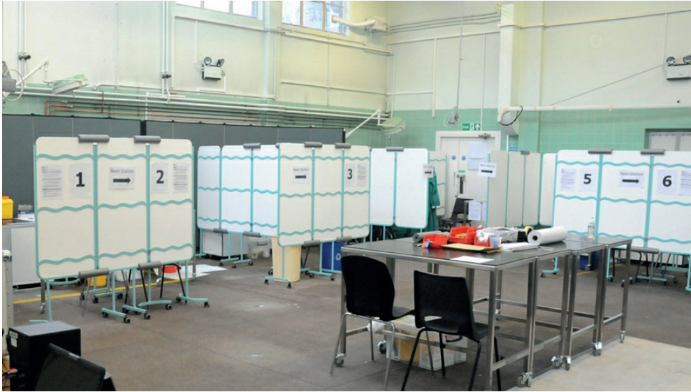
Figure 2. Stations set up for an objective structured clinical examination (OSCE) in the clinical skills laboratory at the School of Veterinary Sciences, University of Bristol, UK.