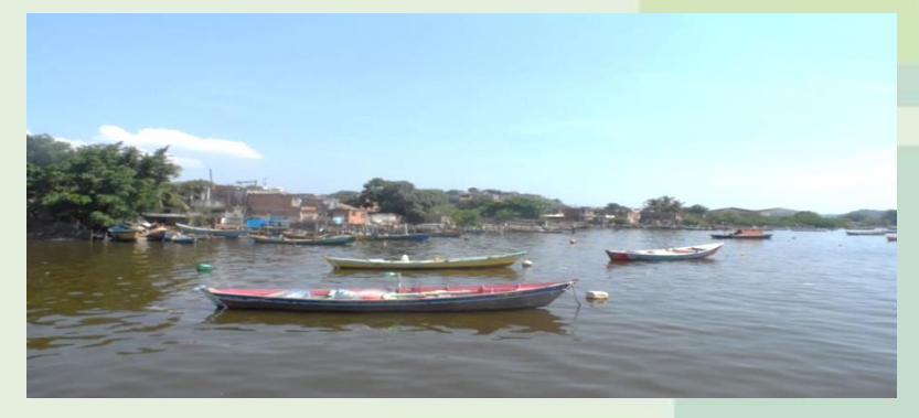
Figure 1. Fishing Village of Cassinu Community (Gradim, Sao Goncalo - RJ)

Initially, we found some difficulty, because we realize that fishermen were sleeping at the time we arrived the place, as they work at night and dawn. The president of the association got acquainted with the instrument to be applied and mediated this process, suggesting that we scheduled a specific date for the start of data collection inside the