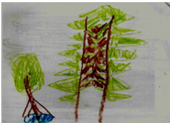
Picture 4. Image of child of 9 years and who has the interrupted communication with the father.

Picture 3 and picture 4 are images of a child of 9 years and who has the interrupted communication with the father.