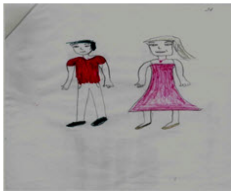
Picture 1. Image of the child on 9-year-old girl of divorced parents, but with regular contact with both parents

influence in the development of the self-concept and at the same time generally in the psychological development of the personality of the children. Characteristic is that the regular contacts with the parent influences the formation of an adequate self-concept that can be noticed in picture 1 where can be noticed that the drawing is adequate to the age of a 9-year old girl of divorced parents; however with regular contacts with the both parents, a noticeable separation from the social surrounding is present, but later she easily adapted to the new surroundings.