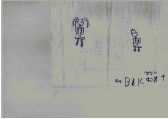
Picture 2. You can clearly see the presence of reduced ego in this child of divorced parents, drawing small figures and weak stalk reflect the reduced ego

In the picture 3 and 4 aggressiveness which is accumulated in this child who is at the age of 8 can be noticed and he has constant communication with the father and therefore in him a frustrating feeling appears along with suppressed aggressiveness, traumatic experience (the knot at the root of the tree) through which this kid went through is also the reason for aggressiveness present in him.