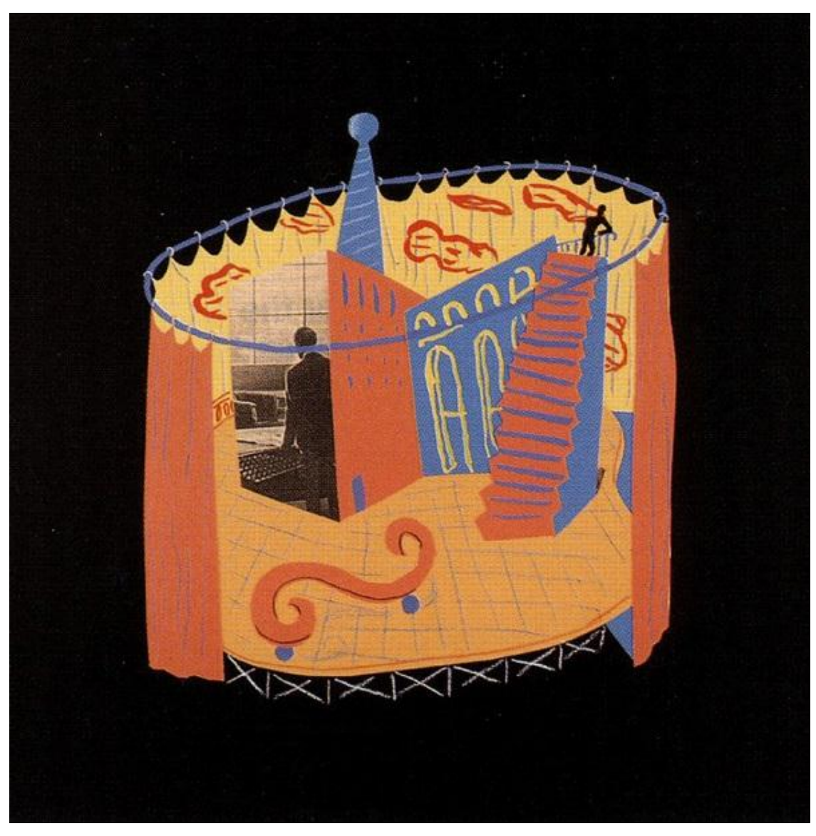
Fig. 3. 120 Minutes. Museo-Casa Natal de Jovellanos.

The design for 120 Minutes offers a variety of possibilities. The set is solved by a giant screen that wraps around the scenario. Inside we found a staircase<sup>15</sup> that rises to the ceiling, where a male figure seems to descend. At the back, the composition ends with single architecture with a man photograph. In this case, the communication is determined by the screen. Interview Area A and B results determined by its architecture. The space is relatively small, so Botas' expertise was to introduce all the elements and distribute them on set harmoniously. Despite the complications, the communication between the public is direct and very open. In both of these sets, the guess star has a prominent place, where the public almost have a complete view. On Band performance area, Juan Botas bore in mind the feedback to resolve the set with multiple points of view. At the back, we can see a staircase and several images cropped of a newspaper. The series ends with six designs for VJ sets.