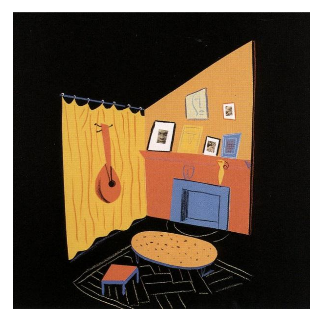
Fig. 4. VJ sets #5, 1991.Museo-Casa Natal de Jovellanos.

All of them seem to be like an indoor room of a typical house. Botas' idea consists of creating a home space, making a relaxing atmosphere for the VideoJockey<sup>16</sup>. The essence of these designs lay in creating uninhibited, intimate and close to both: issuer and receivers of this environment. Another two, The week in rock and The day in rock , show an interview area made with newspaper collages, in which we find in the center a table with a chair to be used by the program's presenter. But all the composition culminates with a big eye on the top. This point receives all eyes, therefore achieving a certain depth of field. In both the curious proposal results amazing for the MTV public.