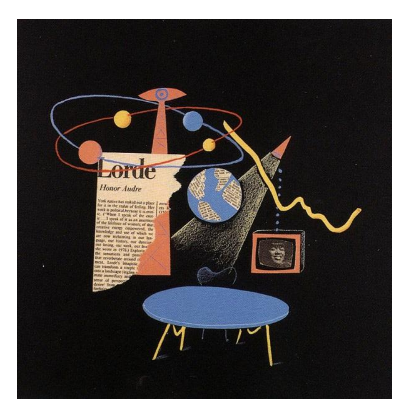
Fig. 5. The day in rock, 1991. Museo-Casa Natal de Jovellanos.

The scenarios were intended to be as a means of two-way communication between spectator and spectacle. The space which they developed provided multiple points of view and endless communication possibilities, such as live and television audience. Some of them offered from a two main views to the possibility of an interaction from a 360 degree view. Furthermore, the expressionism is presented in all of the designs generating a subjective view of the set. Objects with enormous sizes in contrast with other elements less emphasized are one of sets characteristics. Without a doubt, they are pictorial expressionist sets, where the perspective is deformed and architectures serve to action. Moreover, the influence of Joan Miró, Picasso, and David Hockney is present in the majority of these sets. Botas' used some reminiscences from Miró's