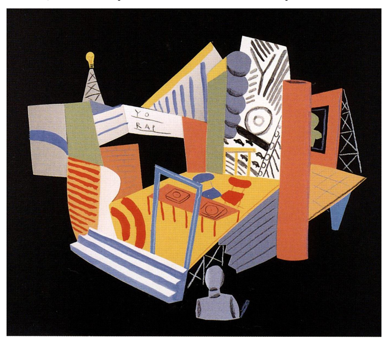
Fig. 2. Yo MTV Raps, 1991. Museo-Casa Natal de Jovellanos.

The first of them, Yo! MTV Raps , provides a scene surrounded by architectural decorations. In its center there is a small table and a couple of chairs. This interview area seems to be surrounded by the rest of components. However, it offers a comprehensive view at the action develop which.