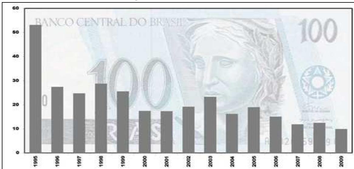
Graph 2 – Selic Interest Rate