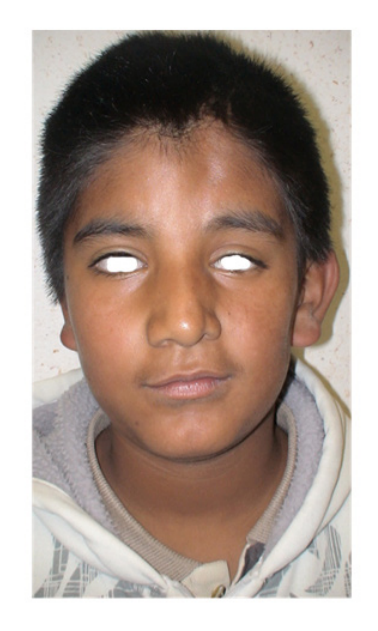
Figure 2. Patient does not show hyperpigmentation or depigmentation in the neck.

Figure 1. Hemifacial atrophy on the left side with apparent sinking of structures on the affected hemiface.