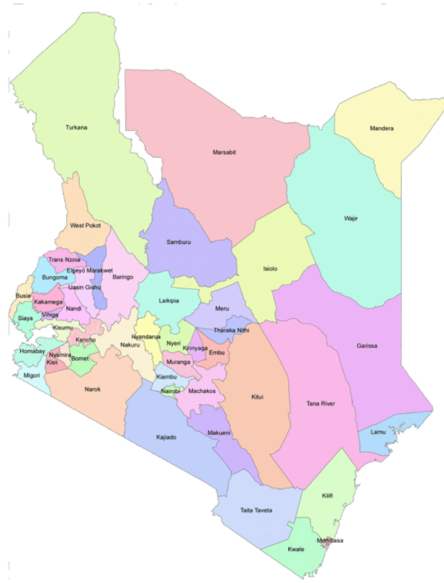
Figure 1: Administrative divisions of Kenya

The study covered the region within the administrative and political boundary of Kenya. It is divided into 47 administrative divisions called counties in a devolved tier system based on its recently passed constitution of 2010 (Figure 1).