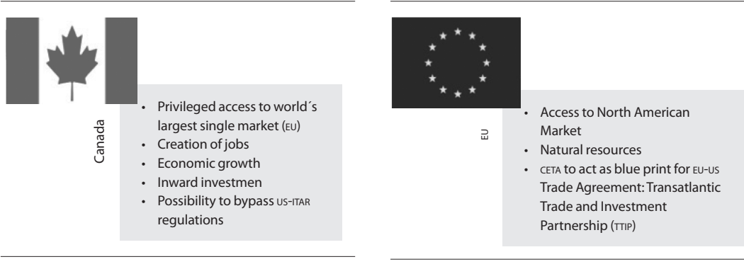
DIAGRAM 3. CETA: WHAT'S IN IT FOR CANADA?

rican Free Trade Agreement (NAFTA). CETA'S regulations will open the door to European companies to compete with US exporters on the Canadian market. This will level the playing field, as the EU will benefit from preferential treatment going beyond NAFTA in the area of government procurement, and in certain service sectors, such as maritime transport and possibly space transportation (EU Commission, 2013).