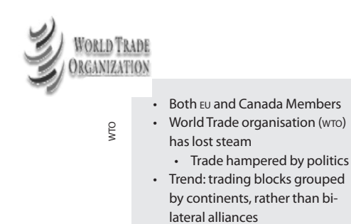
DIAGRAM 5. INTERNATIONAL TRADE: CANADA, EU & THE WTO

both CETA and TTIP come into force, we might see in a next step the creation of a whole new trading block in the form of a multilateral trade agreement between the wTO members Canada, EU, Mexico and the US being established in the future, acting as a counter balance to the Asian market.