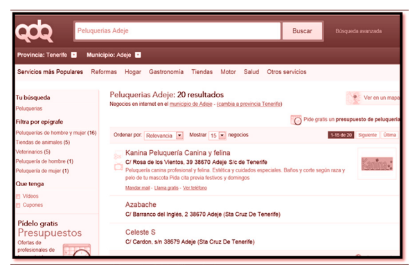
Illustration 1.: QDQ search example

The data obtained derived from searching the two provinces of the Canarian archipelago: Santa Cruz de Tenerife (comprising the islands of Tenerife, La Palma, La Gomera and El Hierro) and Las Palmas (comprising the islands of Gran Canaria, Lanzarote and Fuerteventura). To follow an order we have examined each island by its municipalities. In all of them we have searched by "peluquerías" ('hairdressers'), what rendered a specific number of this type of enterprise and a list with name, address and telephone number; from this we extracted the hairdressers which included an Anglo-Saxon genitive <'s> in their name. The illustration below shows a sample search from QDQ (2012), referred to Adeje, a municipality of Tenerife island.