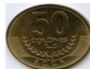
Figure 4. Costa Rican coins