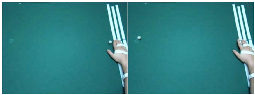
Figure 2: Scheme of the experimental set up used in Lago-Rodriguez et al. (2013). Participants were asked to hit a ball by an abduction of the right index finger while their hand was attached to the table in a fixed position.

and physical practice lead to equivalent levels of motor performance. In line with previous hypotheses, these results suggest that for transitive actions, observing an execution model may have additional benefits compared with physical practice, only when the action to be learned presents more than one execution strategy (Buchanan & Dean, 2010).