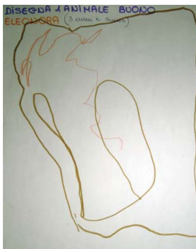
sketch 1: Cat with long whiskers

Eleonora (3 years and 5 months old), when asked to draw a good animal, chose a cat and drew it with an airy and spacious brown line, while imitating the cat's 'miaow'. When asked to explain what she had drawn, she pointed out the orange line similar to the long whiskers of a cat. After identifying a snake as a bad animal, she filled the sheet with jagged lines with acute angles characterized by rapid changes in directions.