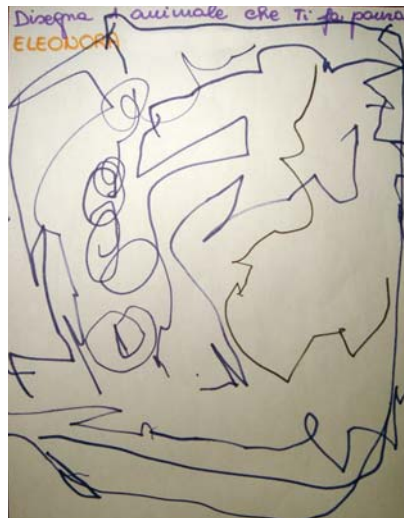
sketch 2: The bad snake

Valentina (2 years and 10 months) scribbled many coloured marks on the sheet, which she later identified to be animals she likes. (sketch 3). A great difference can be noted compared to that of the bad animal; in this case (sketch 4), there are no circles, but short lines, jagged and decisively more prominent. In the second drawing, Valentina specifies that she drew a monster on the left, a scratching cat in the centre and a shark on the right.