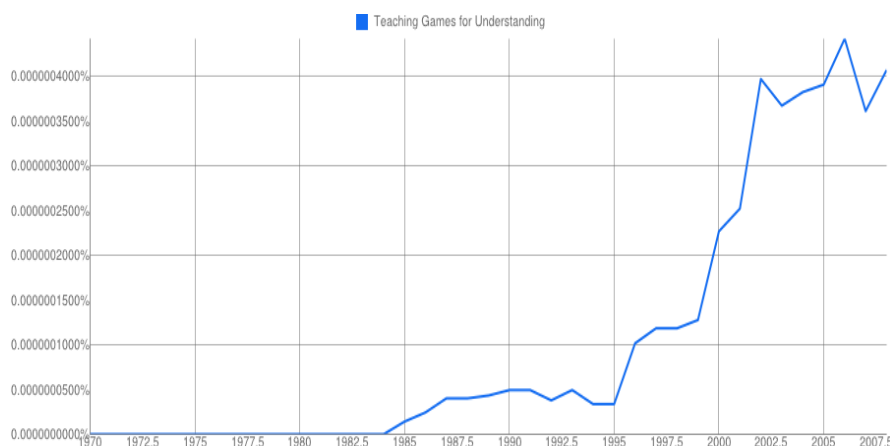
Figure 1: Frequency of the phrase 'Teaching Games for Understanding' in published literature from 1970-2008 (downloaded from Google, 2012)