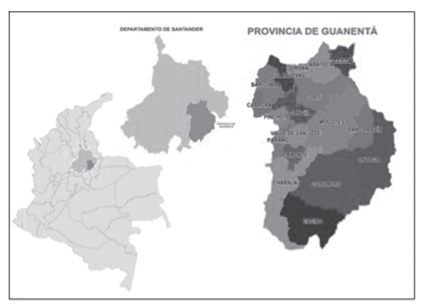
Figure 1. Map and location of the Guanentá Province - Colombia

The case study in this research project is in the region of Guanentá Province, located in southeastern Santander Department, in the eastern range, or cordillera , of the Colombian Andes. The province has a total area of about 3,800 square kilometers and includes 18 municipalities (a political-administrative subdivision similar to US counties), including Aratoca, Barichara, Cabrera, Cepita, Coromoro, Curití, Charalá, Encino, Jordán Sube, Mogotes, Ocamonte, Onzaga, Páramo, Pinchote, San Gil (capital of the province and declared to be the tourism capital of the Department of Santander), San Joaquín, Valle of San José, and Villanueva (see figure 1).