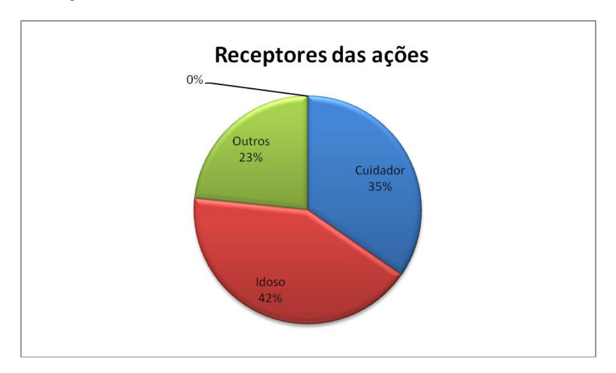
Graph 1. Receptor actions. (Other; Caregiver; Elder.)

From the analysis of data collected from 29 April to 7 May 2012 found 16 texts. The actions described in the texts were grouped into two broad categories: those related to the caregiver, family and facing the demented elderly. Of 107 listed stocks, 37 were directed to the caregiver-family, 45 to 25 and older were several actions that do not fit into any of these categories.