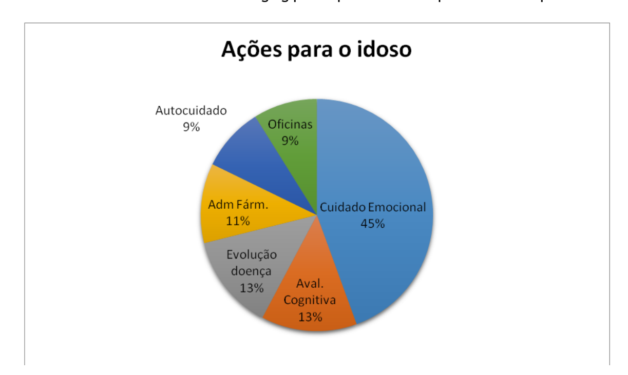
Graph 3. Actions for the elderly. (Self-care; Therapy workshops; Emotional care; Cognitive evaluation; Evolution of the illness; Pharmaceutical management.)

Of the 45 actions turned to the elderly, 20 involved emotional care, six, cognitive assessment, six, assessment of disease progression, five, medication administration, four, four stimulus to self-care and encouraging participation in therapeutic workshops.