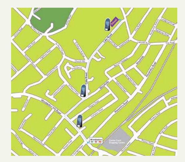
Figure 4: Map of the Walking Route between Wimbledon Town Centre and Ricards Lodge School and Swipe Point Locations.

For every completed walk, the students are then awarded a point which is displayed on their individual Step2Get web account. Participating students can monitor the number of days that they walked the route and how many more days they need to walk before earning a reward. A cinema ticket and a £5 TopShop6 voucher could be claimed after completing 5 and 8 'walks', respectively. An automated email is sent from the website to inform the school as to which students have earned and redeemed rewards. The student then collects the reward from the member of school staff charged with administering the scheme. Figure 5 shows one of the posters with which the Step2Get scheme was promoted and explained to the students.