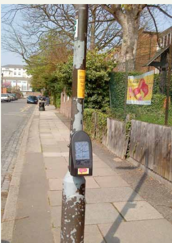
Figure 2: Photo of Swipe Points.

The only way of earning rewards without walking would be to give one's RFID card to another student to swipe. In order to prevent such fraud, the third swipe point was positioned within the school grounds, where school staff checked for and thus prevented multiple swipes performed by single students. The Step2Get scheme was launched on 20th April 2009 immediately after the Easter holidays, and was stopped on the 14th June 2010. Figure 4 shows the walking route with the exact location of the three swipe points.