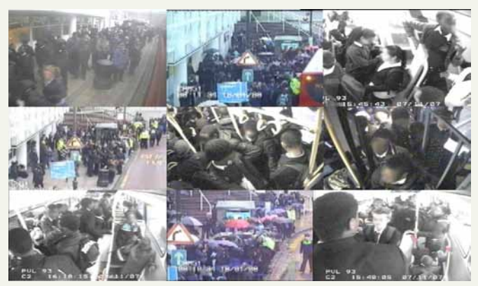
Figure 1: showing Close Circuit Television (CCTV) footage of bus stop during morning peak.

A solution was needed to reduce the peak bus demand of school children and the crowding at the bus stop. A standard solution would have been to increase the number of busses on the route to meet the demand, but this would have increased bus operation costs and would have caused bus on bus congestion in an already extremely congested part of London. More officers of the Safer Transport Police<sup>5</sup>, a service funded by TfL, were deployed on site to manage the number of people getting onto the bus and to reduce crowding at the bus stop, but the problem persisted.