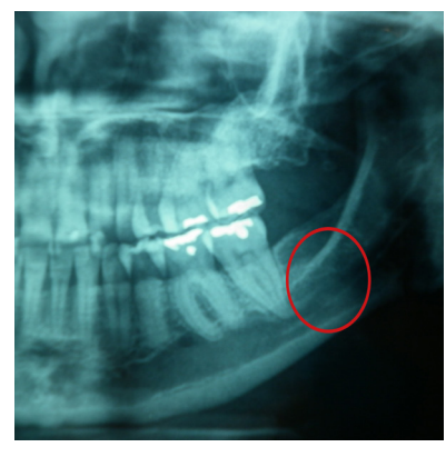
Figure 3. Postoperative orthopantomography six months after removal of the tumor. In the reconstruction with lyophilized bone and collagen membrane, good osseointegration whithout bone changes or variations in the course of the inferior alveolar nerve can be observed.

sule<sup>15,16</sup>. Also, this condition may be associated with the presence of metabolic and thyroid disorders as in the case of the granuloma annulare<sup>17,18,19</sup>.