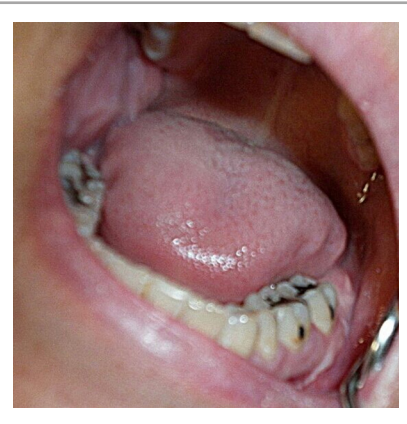
Figure 4. Postoperative clinical view three months after the procedure. Apparently, no evident changes were observed in the mucosa and the patient was reference asymptomatic.