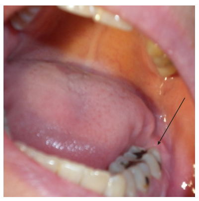
Figure 2. Preoperative clinical view. The edema can be observed in the circumscribed retromolar region.