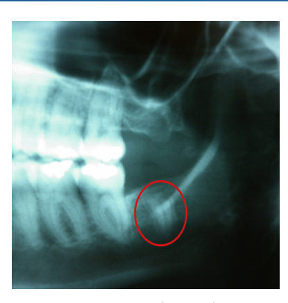
Figure 1. Preoperative radiographic view of the odontogenic tumor.