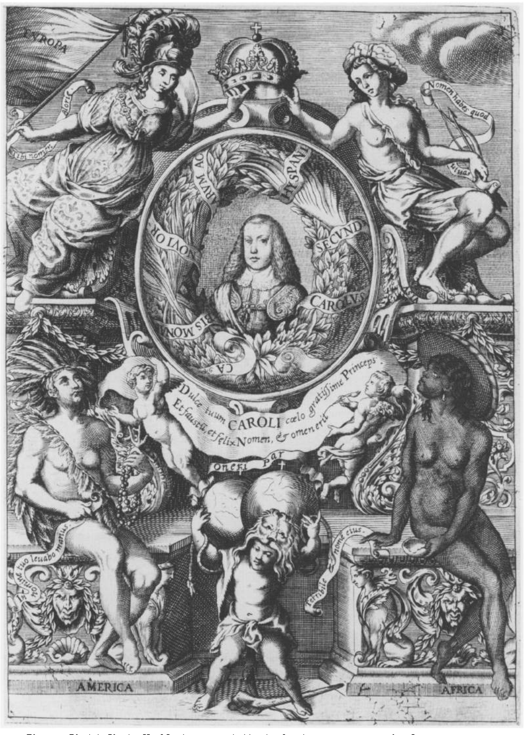
5. Giacomo Piccini, Charles II of Spain surrounded by the Continents and as the infant Hercules 'equal to the weight'. Frontispiece to Jerónimo de Basilico, Las felicidades de España ..., Madrid 1666