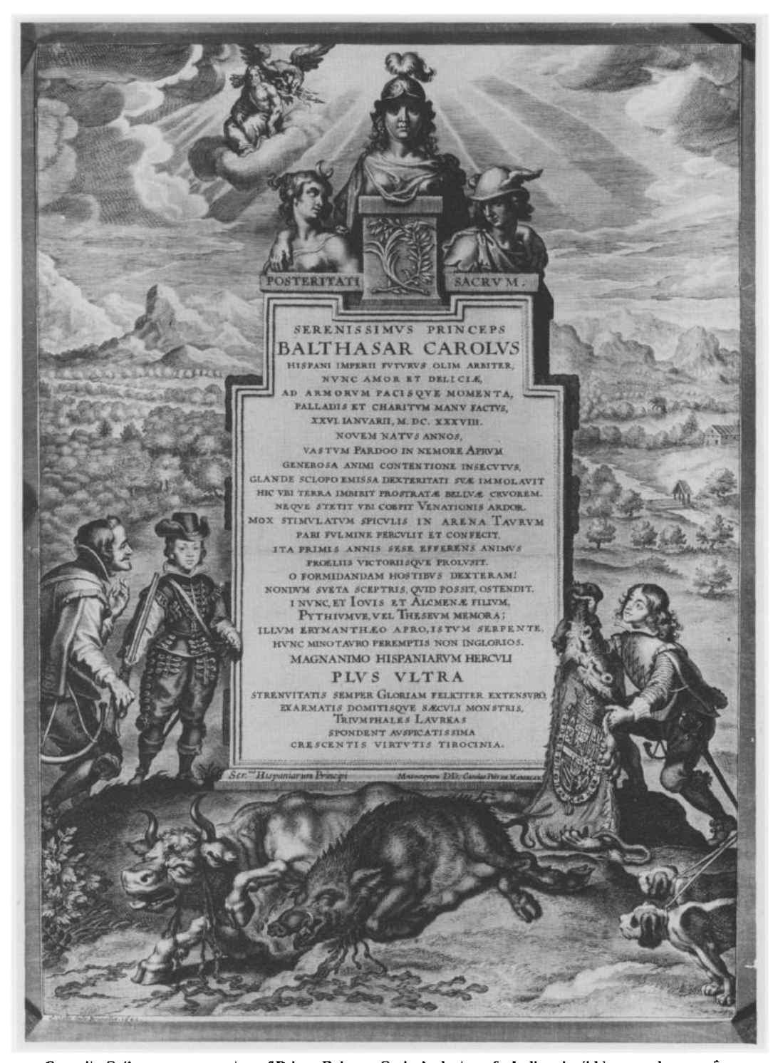
4. Cornelis Galle, commemoration of Prince Baltasar Carlos's slaying of a bull and wild boar at the age of 9, on 26 January 1638. Printed by Charles-Philip de Marselaer, Antwerp 1642