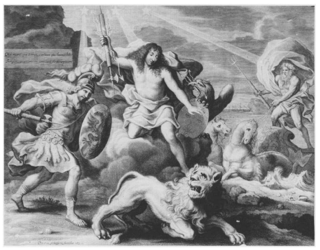
7. Petrus Van Schuppen, Louis XIV as Jupiter, with thunderbolts, attacking the lion of Spain, 1659. Département des estampes, Bibliothèque nationale de France

1966, no. 1710–2; eadem, in GBN (as in n. 1), p. 313, no. 325.