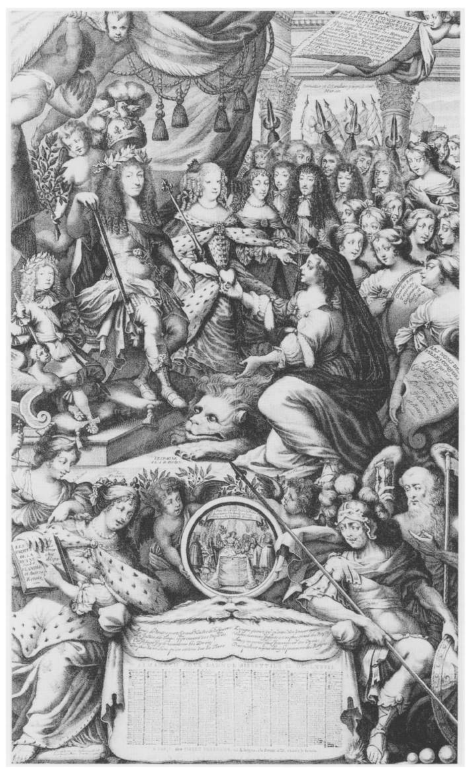
12. Nicolas de Larmessin, illustration for a calendar for 1668, justifying the conquests of Louis XIV of France