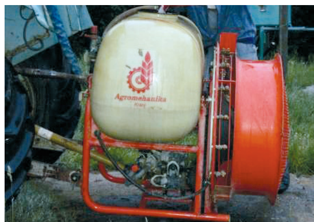
Figure 2. Carried axial fan air-assisted sprayer AGP 440.

Two different spray application techniques were tested, both at MV and LV: (i) a conventional spray application, i.e. a mounted axial fan air-assisted sprayer Agromehanika 440 (AGP 440), (ii) a tower sprayer or selective spray application, i.e. a trailed cross flow air-assisted tower sprayer Dal Degan Morava 1000 (DDM 1000) with crop identification system.