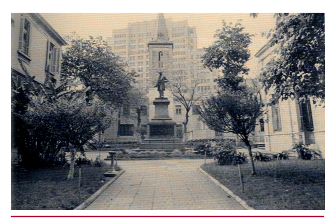
Fig. 3. Central courtyard of the old Hospital de Clìnicas with the monument of Ignacio Pirovano. (From Pergola F, Sanguinetti F [1998]. 'History of the Hospital de Clinicas'.)