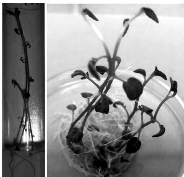
Figure 1. S. tuberosum cv. Granola plantlets after 8 weeks of culture. a) Solid medium. b) Liquid medium.

We tested different concentrations of silver nitrate for both cultivars. Table 2 shows the results for the growth parameters estimated. As the AgNO 3 concentration increased, leaf number diminished, stem length diminished and leaf area increased for both cultivars. Plantlets growing on MS medium supplemented with 2 mg·l -1 AgNO 3 show an adequate stem length and a high leaf area. After eight weeks of culture, these plants did not show symptoms of ethylene growth inhibition: epinasty or hiperhidricity (figures 3 and 4).