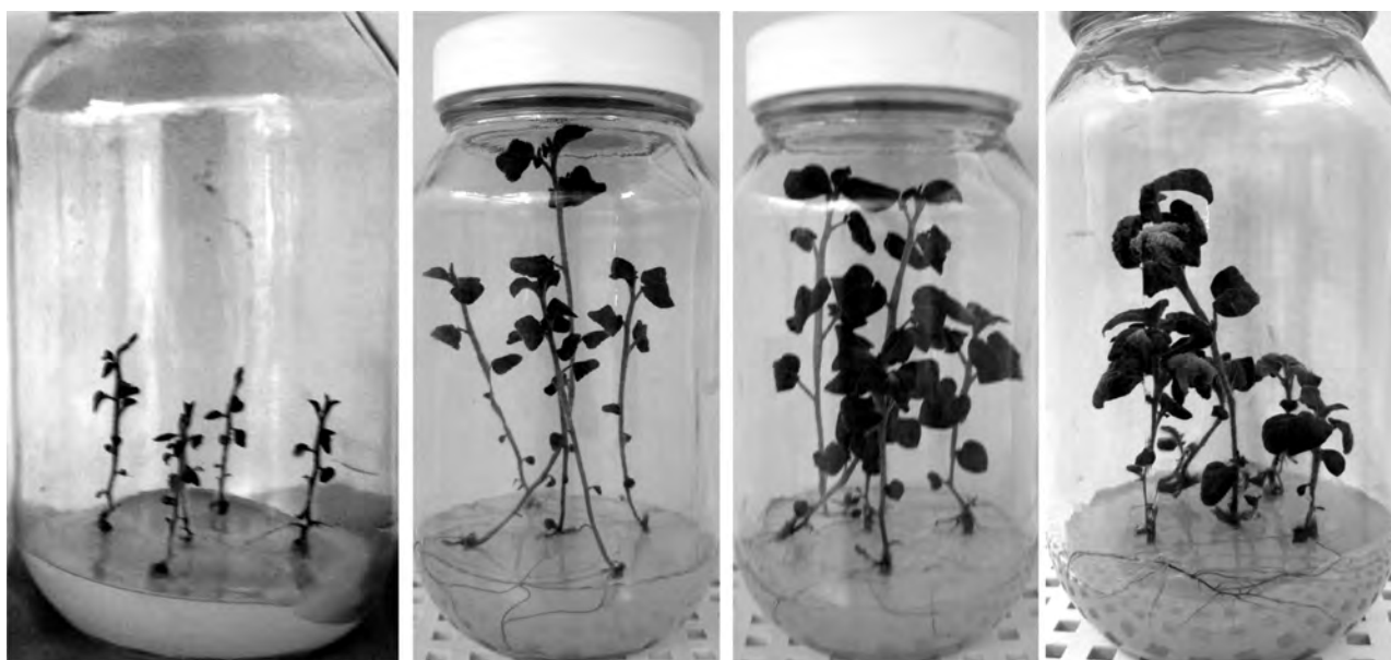
Figure 3. S. tuberosum cv. Granola plantlets growing under different silver nitrate concentrations after 8 weeks of culture. Figure shows details of leaf area at each \text{AgNO}_3 concentration. a) 0 \text{ mg}\cdot\text{l}^{-1} ; b) 1 \text{ mg}\cdot\text{l}^{-1} ; c) 2 \text{ mg}\cdot\text{l}^{-1} ; d) 5 \text{ mg}\cdot\text{l}^{-1} .