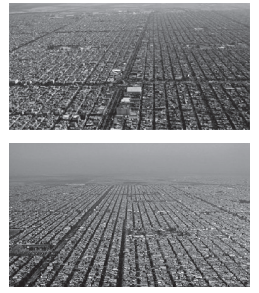
Figura 2 . Aerial view of Neza City.a <sup>a</sup>Photo: Rodrigo Cruz, published in: http://www.ngenespanol.com/articulos/328787/ciudad-neza-historia-contrastes/

Another purpose of this project was to explore which were the emotional reactions of respondents, measured through Mehrabian and Russell's Semantic Differential Scales