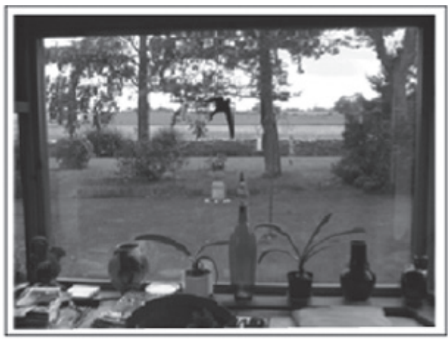
Figura 3. Example of a house with widespread greenery.

The pleasure and arousal variables are significantly related to attitudes towards greenery, which entails a direct relationship between green areas and the pleasure and arousal variables. In other words, green areas in the house produce in the inhabitants increased pleasure sensations, as well as increased motivation in all the activities inside their house. In the case of Mexico City case results were similar. The main contribution of this study was to demonstrate that restorative environments are important for the household.