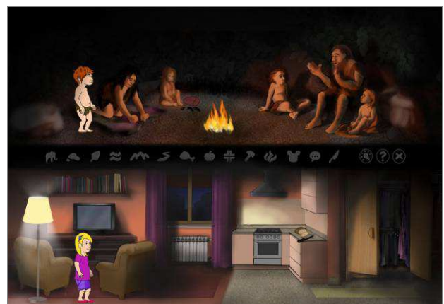
Figure 5 (a). Quests of the Plei-sto-station educational application for children