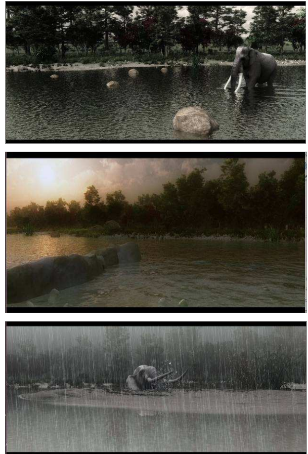
Figure 4 (a-b-c). Three scenes from the movie on pleistocene life, with the Elephas Antiquus character

labs of archaeological excavation, stone flaking, use of flint tools, etc.