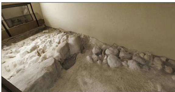
Figure 1 (a-b). The Casal De' Pazzi Museum deposit

Then, museological and museographic actions followed to these works, based on a communication systems that uses textual, verbal, symbolic and technological communication. Nevertheless, in addition to the traditional forms of exhibition, more direct communication tools were preferred, like those of visual and / or interactive type, as well as new educational techniques such as real and virtual reconstructions and hands-on