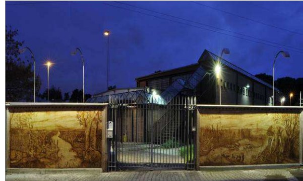
Figure 2. The outside appearance of the Casal De' Pazzi Museum, with the majolica painted panels

labs. The aim is to make the visitor interact with the informations and also to keep his/her attention alive.