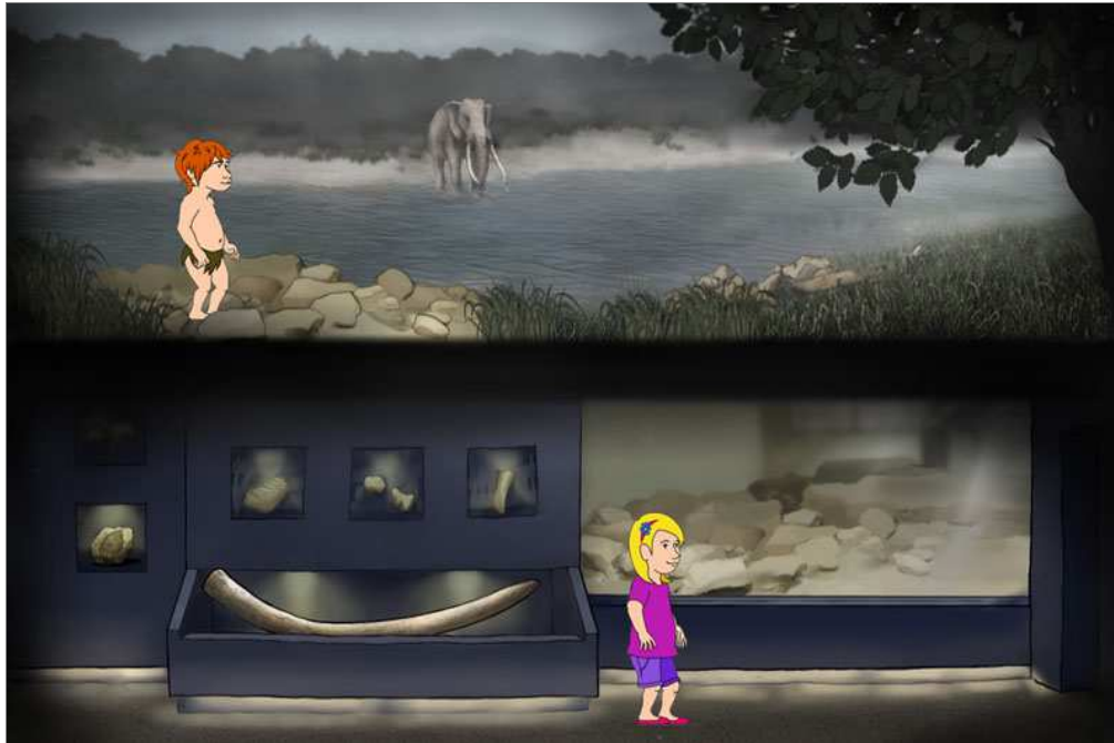
Figure 5 (b). Quests of the Plei-sto-station educational application for children