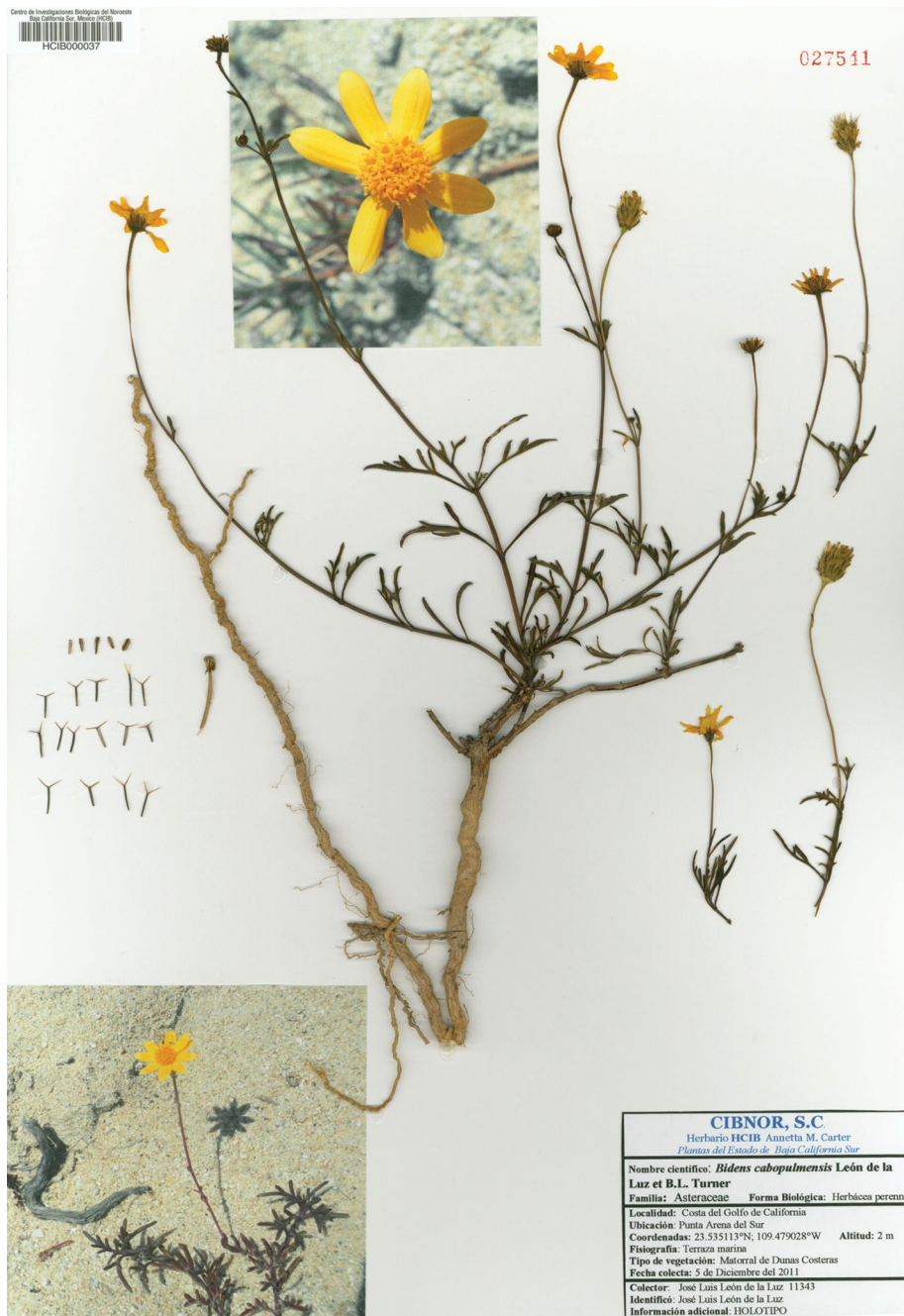
Fig. 1. Holotype of Bidens cabopulmensis .