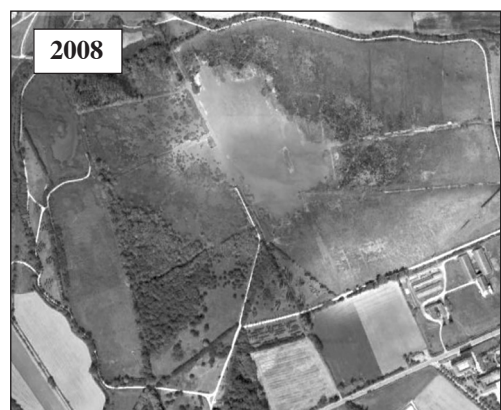
Figure 2 THE RESTORATION OF THE SALBURUA WETLANDS