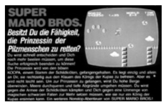
Super Mario Bros. 1985 Nintendo Co. English and German back covers.