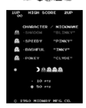
Pac-Man (Namco/Midway 1980) US and European version

It is also worth noting that the original version never displayed Japanese script, this was very early on in the game industry (and even the software industry), and it was programmed in English displaying only English characters. Japanese characters could not be implemented