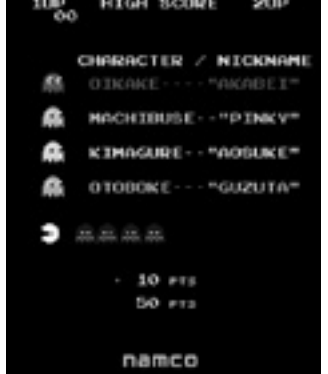
Puck Man (Namco 1979) Original Japanese version

of which is the internationally popular Pac-Man . The Japanese name was initially transliterated as 'Puck Man' (pronounced 'pakkuman'), and it is a creation inspired on the Japanese onomatopoeia 'paku paku taberu', normally used to indicate that someone is eating eagerly and it imitates the fish-like opening and closing of the mouth. The initial transliteration into English Roman characters sounded like 'Puck-Man' to Japanese hears, but when localising the product for the US market, they decided that 'Puck' was far too close to the coarse four letter word 'F***, and decided to go for a similar but less troublesome spelling. The solution, 'Pac-Man', proved successful in every sense.