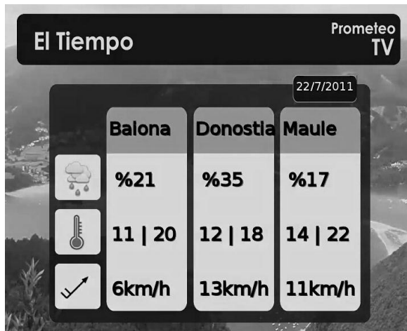
Fig. 3. Platform produced weather report.

This testbed based in the weather information platform does not have real time performance restrictions or high scalability requirements, but it faces dynamic contexts describing a solution extensible from time and localization features to context user-centered multimedia applications. The automation of this process has enormously reduced the cost of producing new contents for weather forecasts and the time needed for the creation of new videos which implies that new content can be updated with higher frequency.