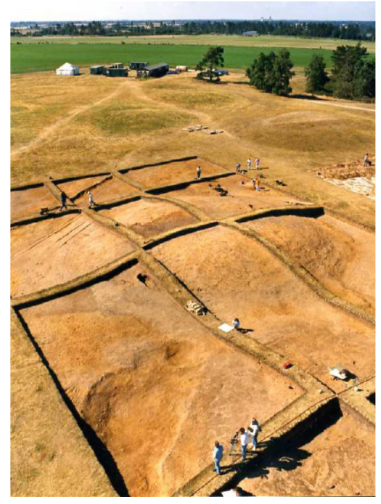
Excavations at Sutton Hoo.

The weakness in the British system comes at the end of the PhD. Whereas Italian students have entered the academic profession as soon as they have won their borsa , in England the newly graduated PhDs have to start looking for work all over again and it depends a lot on luck. British universities are trying to bridge the gap by making sure that there are post-doctoral posts in all their new research projects.