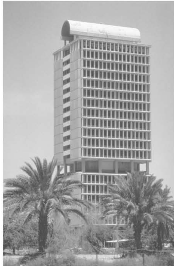
Fig. 2 Walter Gropius University of Baghdad Office Tower

Of course concrete was also used as a finishing material in many forms: smooth, sandblasted, or 'brutal' as in Le Corbusier's 'bton brut', which was the finishing material of his gymnasium inside and outside. 4 There were also other new finishing materials attributed to Modernism, like glass mosaic, best exemplified by Ponti's Ministry of Planning in the color maroon (fig. 5). And as an extension of Modern architecture elsewhere, the Modernists also introduced the wide use of steel, glass, and aluminum, in addition to promoting that famous Modernist trick of 'covering up' the whole building with cement plastering and white paint. 5 On the other hand, the introduction of the high-rise and tall buildings also promoted the use of modern mechanical services, especially elevators, and air-conditioning, the latter of which led to reduction of the role of the traditional climatic design elements to mere decoration, or the predominantly decoration.