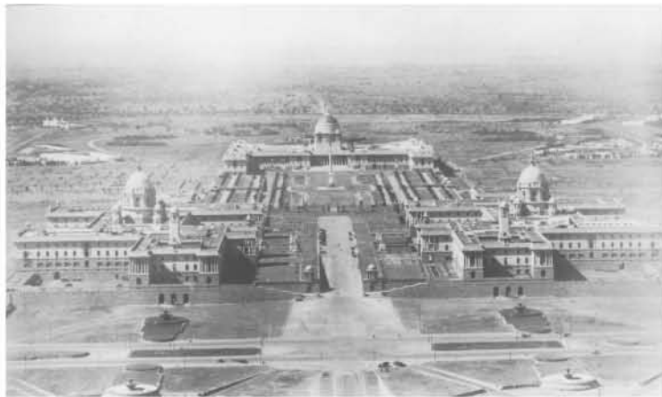
Figure 7b Sir Edwin Lutyens The Viceroy's Palace in New Delhi.