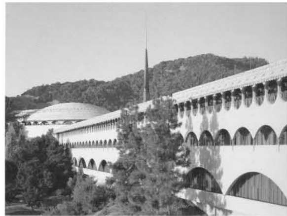
Figure 6 Frank Lloyd Wright Marin County Civic Center, California, 1957.

The Gropius project Jencks was referring to was of course the University of Baghdad. Here again, as with the others, Gropius gives a work that represents his style: his Pragmatic style, if it may so be called. Obviously, at the time, Gropius wasn't adhering to