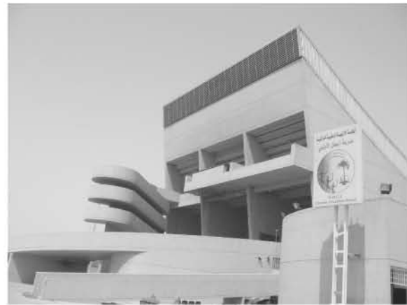
Fig. 4a Le Corbusier

On the other hand, there were some Masters with screaming attempts to derive from the local heritage, like Frank Lloyd Wright in his project for a cultural center with an opera house, 1957, on an island in the Tigris where it bends around the campus of the University of Baghdad. Although this great Master is well-known for his bold new statements and original ideas, which are usually quite reasonable, one can