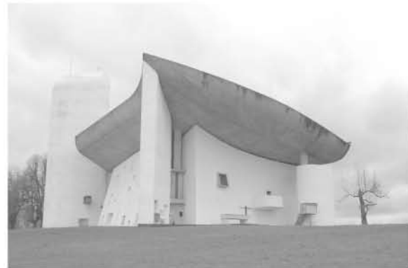
Fig. 4b Le Corbusier