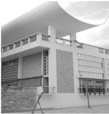
Fig. 3c José Luis Sert

Fundación Maeght, Saint Paul de Vence.