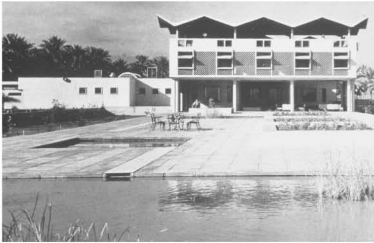
Fig. 3a José Lluis Sert American Embassy in Baghdad.