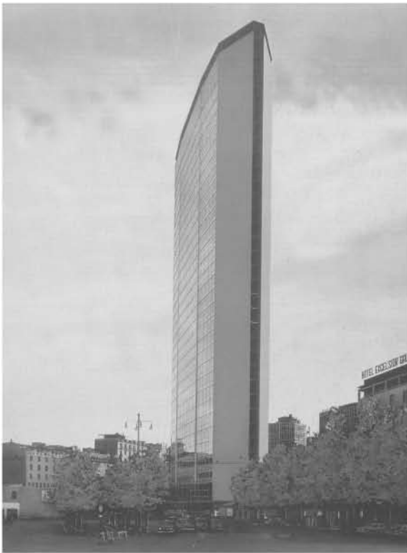
Fig. 5 Gio Ponti The Pirelli Tower in Milan.

that's the style most of the Masters ended up with in spite of their calls for an organic, functional, or rational architecture. In his Modern Movements in Architecture (1973), Charles Jencks explained this phenomenon stating that in spite of their previous statements, Wright and Gropius were producing in the '50's far-from-organic works with contradictory aesthetic and structural aspects, and obviously unidentifiable functions. He added that it was ironic how both have designed their most inorganic projects for Baghdad, but it was probably because its tales of the thousand and one nights stimulate designers to conjure up their most imaginative and formalistic approaches.