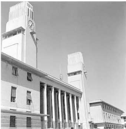
Figure 7a Wilson & Mason Baghdad Central Station.