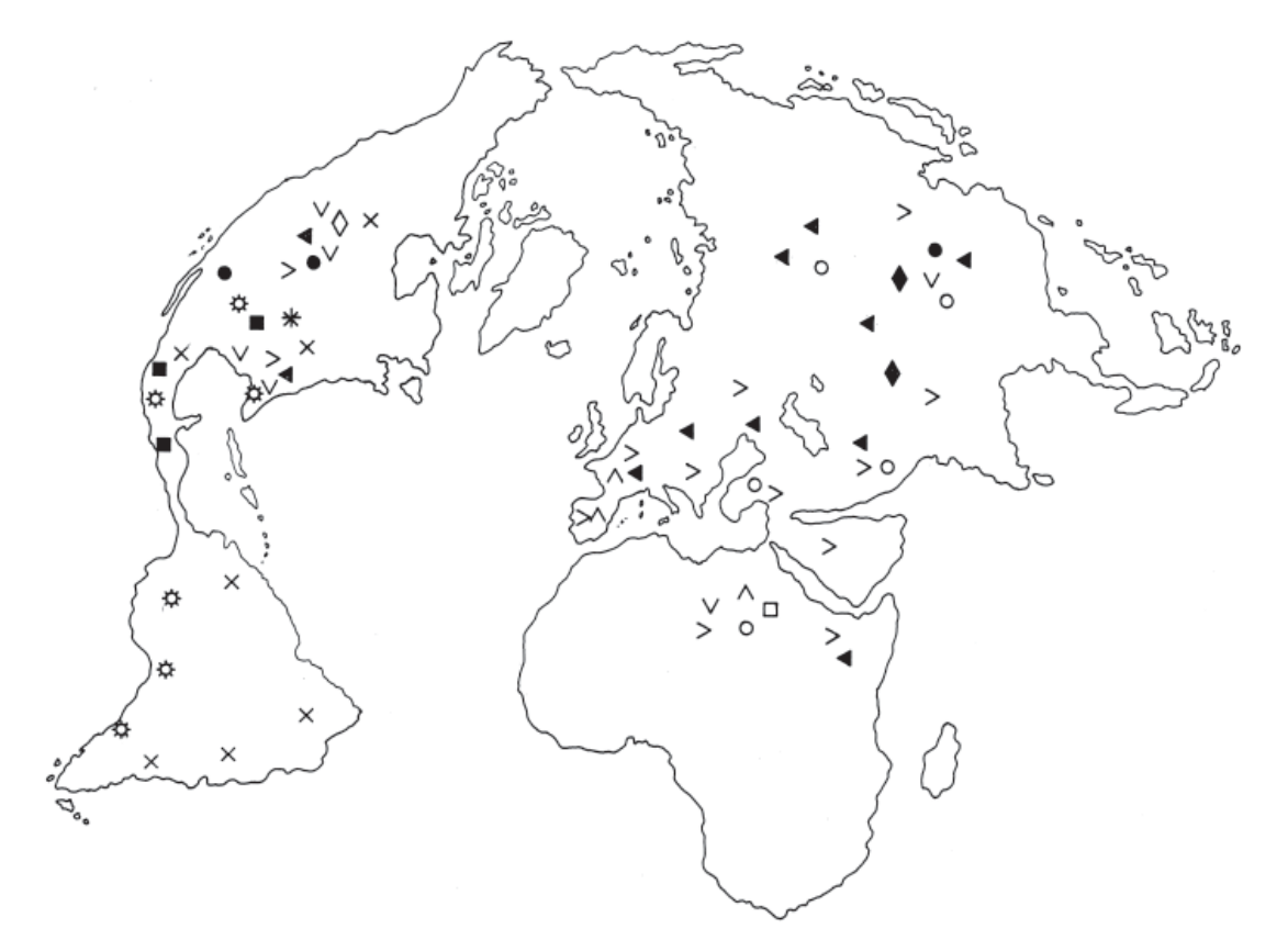
Figure 2. Map showing the distribution of gomphotheres. Symbols: \Box : Phiomia , North Africa; \circ : Protanancus , North Africa and Asia (China, Mongolia, Turkey and Pakistan); \wedge : Archaeobelodon , North Africa and Europe (France and Spain); \bullet : Serbelodon , China and North America (California and Nebraska); \vee : Amebelodon , Noth Africa, China, and North America; \blacktriangleleft : Platybelodon , East Africa, South Asia, China, Mongolia, Europe, and North America; \succ : Gomphotherium , North and East Africa, South Asia, China, Europe, and North America; \blacksquare : Rhyncotherium , North America; \diamond : Eubelodon , North America; \diamond : Gomphotherium , North America; \diamond : Binomastodon , East Asia, China, and Mongolia; \Leftrightarrow : Cuvieronius , North and South America: (Kansas); \diamond : Sinomastodon , East Asia, China, and Mongolia; \Leftrightarrow : Cuvieronius , North and South America.

A major biogeographic event of the Gomphotheriinae clade is represented by the dispersal of the ancestor of