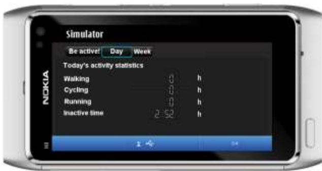
Fig. 3. Activity recognition application for Symbian^3 smartphones.

an accuracy of 94.5%. It should be noted, however that this difference is not statistically significant according to paired t -test. Also, each of the five activities are recognized with high accuracy.