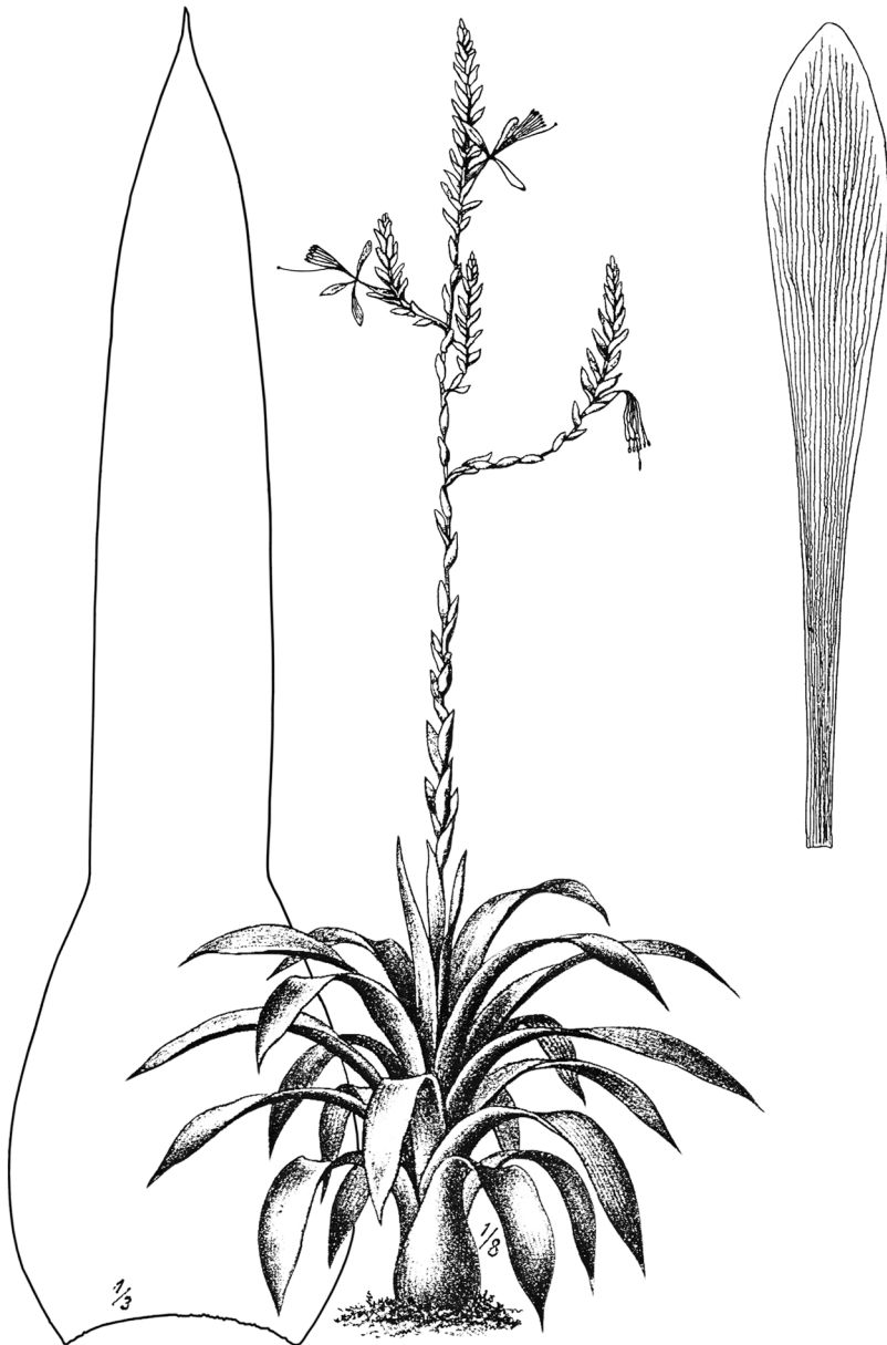
Fig. 3. Lectotype of Tillandsia macropetala . Figure 50 in Wiener Illustrierte Garten-Zeitung 12. 1887.