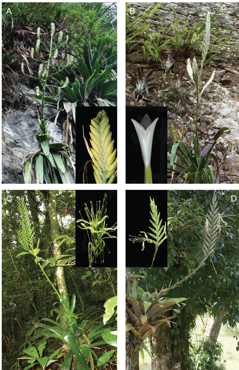
Fig. 2. A. Tillandsia grandis ; B. Tillandsia heterophylla ; C. Tillandsia macropetala ; D. Tillandsia viridiflora.