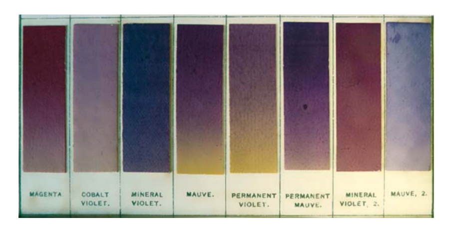
"Specimen Tints of Winsor & Newton's Artists' Oil and Water Colours, p.1878-a.1882. Magenta. Cobalt violet. Mineral violet. Mauve. Permanent violet. Permanent mauve. Mineral violet, 2. Mauve, 2." Winsor and Newton's own earliest tint card, showing the magenta strip.