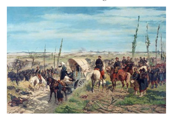
The Italian Camp at the Battle of Magenta, 1859, by Giovanni Fattori (http://upload.wikimedia.org/wikipedia/commons/8/85/BattleofMagenta.jpg, last accessed July 2011)

Solferino, a neighbouring town at which a battle was fought a few days later, also bestowed its name on a dye that was similar to aniline magenta.