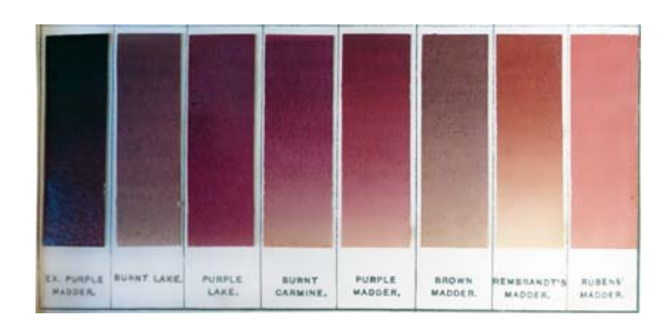
Specimen Tints of Winsor & Newton's Artists' Oil and Water Colours, p.1878-a.1882. Ex. Purple Madder. Burnt Lake. Purple Lake. Burnt Carmine. Purple Madder. Brown Madder. Rembrandt's Madder. Rubens' Madder. (sic). Winsor and Newton, with permission.